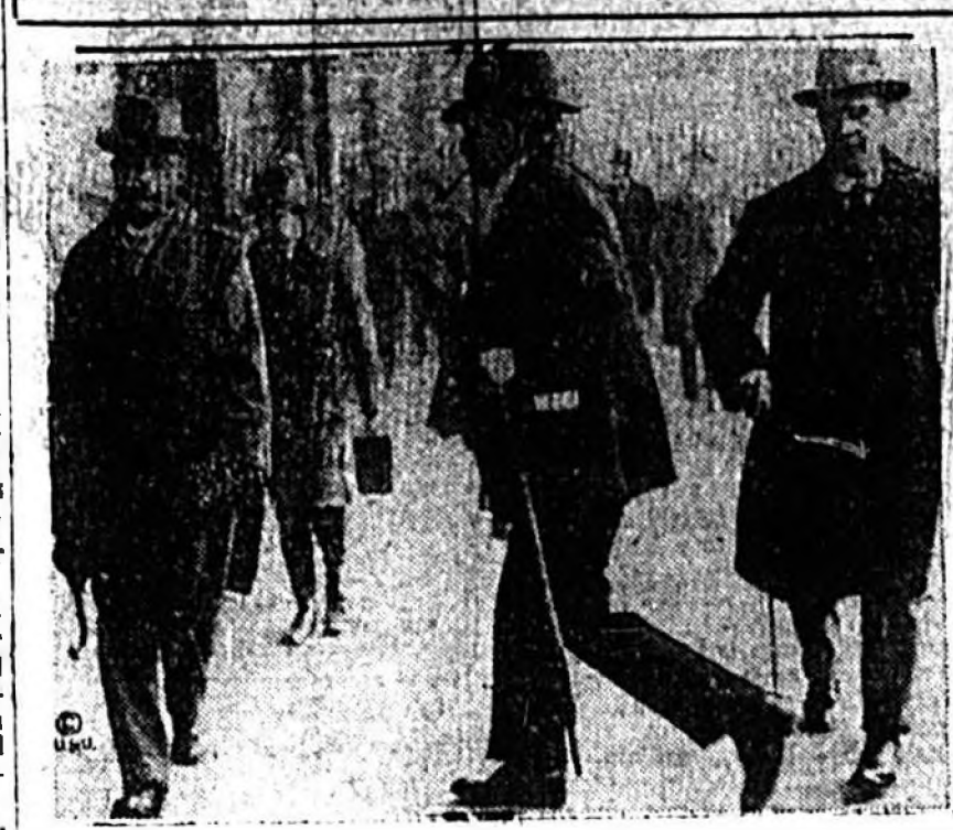
No secret service men surrounded Premier Stanley Baldwin (center) of Great Britain as he made his way to Conservative headquarters at Palace Chambers, London, for a conference with party leaders. And very few recognized the premier as he moved along, minus overcoat, and with pipe in mouth.