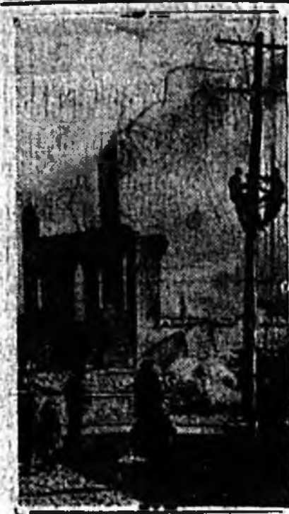
This picture shows how completely the $5,000,000 Jersey City (N. J.) fire gutted the building in its path. Structures for several blocks around looked like this by the time it was all over.