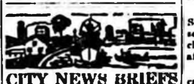
CITY NEWS BRIEFS

The day was devoted entirely to the Thanksgiving day contest climaxed last night by a turkey dinner at the founders' banquet in Georgia hall. The President dined a huge gobble for Mrs. Roosevelt and children patients at his table.