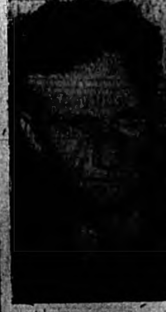
James F. Cannon James F. Cannon, national secretary of the Socialist Workers Party, was among the 50 members indicted by a Federal Grand Jury in St. Paul, Minn., and charged with conspiring to overthrow the U. S. government by revolution. Cannon, 44, is regarded as the principal American disciple of the late Leon Trotsky.