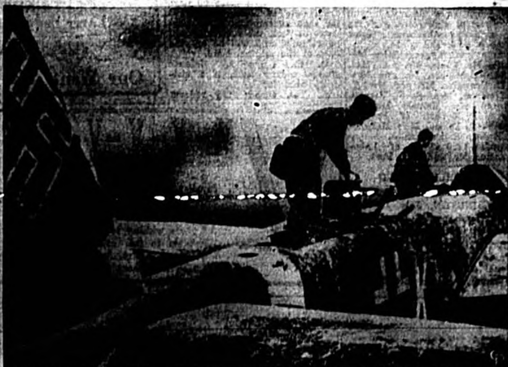
Radiofoto RCA Test Transmission Russian soldiers inspect wreckage of a German plane brought down behind the battle lines on Soviet territory. Soviet communiques report hundreds of Nazi planes have been shot down in the fierce fighting on the Eastern Front.