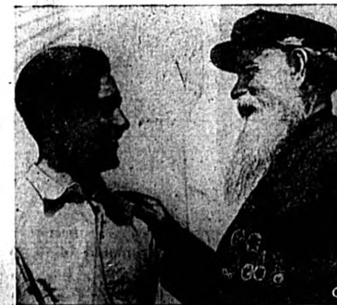
Radiofoto RCA Test Transmission An unnamed grandfather and his grandson make a proud looking pair after both enlisting in Russia's Popular Volunteer Force, says Moscow, which flashed this picture by radio to New York.