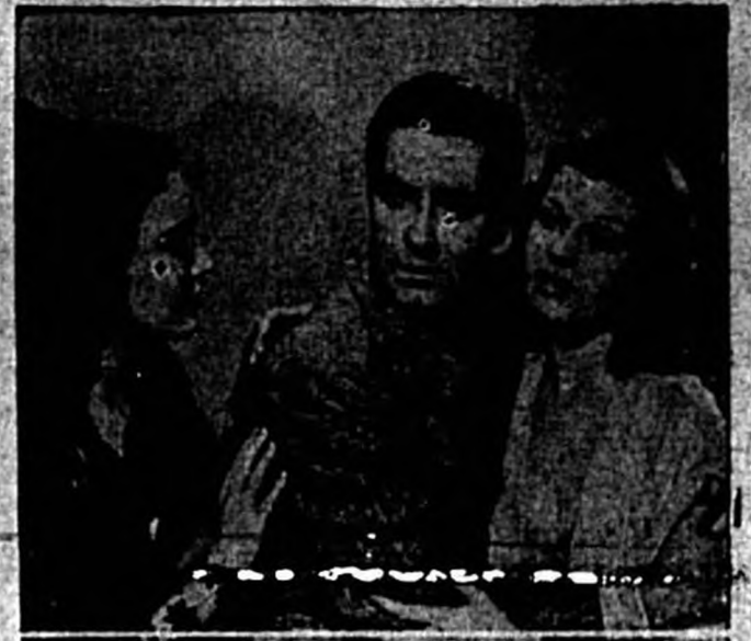
BEARING THE advance billing "The most thrilling love story you have ever seen—the most magnificent entertainment ever brought to the screen," "Blood and Sand," in Technicolor, starring Tyrone Power with Linda Darnell, Rita Hayworth, Nastimova, Antony Quinn, Lynn Bari and a host of others, will be presented tomorrow and Monday at the Ritz.

Tonight at 11:30—Midnight Show—"CHAMBER OF HORRORS"; Comedy; Cartoon, and "Take It or Leave It" with Bob Hawk. Sunday, Monday—"BLOOD AND SAND" with Tyrone Power, Linda Darnell, Rita Hayworth and Nastimova. Also: cartoon and Metro News of the Day. Tuesday, Bargain Day, double program—"REACHING FOR THE SUN" with Joel McCrea, Ellen Drew, Eddie Bracken and Billy Gilbert. Also old favorite returned: "BABES IN ARMS" with Mickey Rooney and Judy Garland. Wednesday, Thursday—"THE BIG STORE" with the Marx Brothers, Tony Martin, Virginia Gray, Henry Armetta and Sla-Hits and a Miss. Also—"CRIME DOESN'T PAY" short; Robert Benchley in "THE FORGOTTEN MAN" and Universal. Friday, Saturday—"ROBBERS OF THE RANGE" with Tim Holt, Virginia Vale and Ray Whitley. Also: "MEN OF THE TIMBERLAND" with Richard Arlen, Andy Devine and Linda Hayes. Added: Chapter Two, new serial, "JUNIOR O MEN".