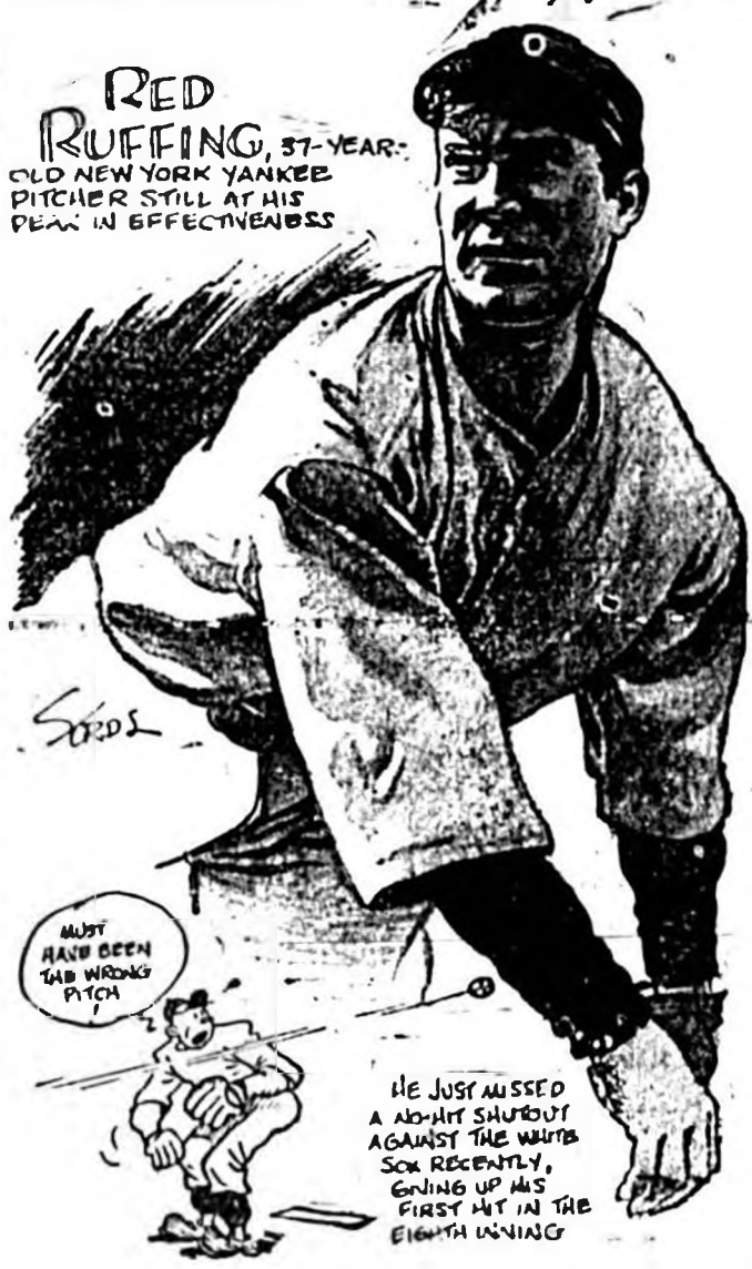
RED RUFFING, 37-YEAR-OLD NEW YORK YANKEE PITCHER STILL AT HIS PEAK IN EFFECTIVENESS

The days' victim was Marius Russo, Yankee southpaw who likewise granted only six hits while fanning a half-dozen Indians. All he got out of it was a wet skin and his sixth setback of the season, against eight wins. The Indians broke a 0-0 all tie to take the winning run on the seventh. Oscar Grimes marked a double which rolled to League Park's rightfield wall, took third on Ray Mack's bunt single and tallied easily on Rolfe Homsey's high bouncer to Shortstop Phil Rizzuto.