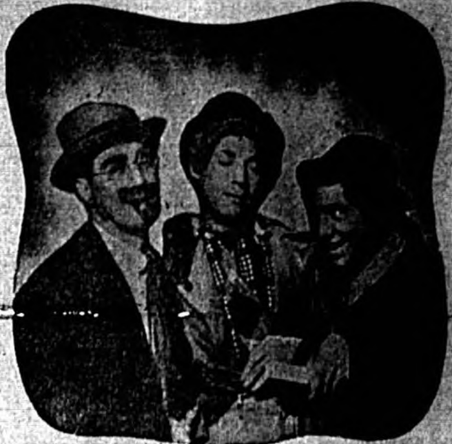
SAID TO be their last picture, "The Big Store," starring the Marx Brothers with Tony Martin, Virginia Gray and a typical Marx Brothers cast, will hold forth next Wednesday and Thursday at the Ritz Theater. A free admission-aluminum for defense matinee for all kids on Wednesday has been arranged by the local committee.