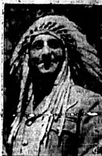
Capt. E. R. Owen Inducted as an honorary chief of the Blackfoot tribe of Indians at the Calgary, Canada, annual stampede, Capt. E. R. Owen of the Royal Canadian Air Force is shown in chieftain's headress. The stampede, "world series of the rodeos," was witnessed by 250,000 persons.