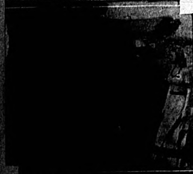
POPULAR YOUNG Tim Holt is shown with blonde Virginia Vale in a scene from "Robbers of the Range," action-filled picture of the "Frontier Fight" with terrific odds in the historic days of the building of the Union Pacific Railroad, coming next Friday and Saturday to the Ritz Theater.