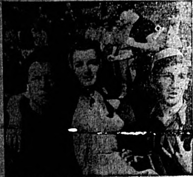
SUNSHINE, HEART-BREAK and a terrific wallop are all packed into Paramount's lovable comedy of love, "Reaching for the Sun," starring Joel McCrea, Ellen Drew and Eddie Bracken, which will be part of the double program offering Tuesday at the Ritz.