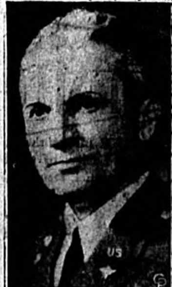
Maj. Gen. Frank M. Andrews Assignment of Maj. Gen. Frank M. Andrews, 57, of the Army Air Force, to the post of chief of the Caribbean Defense Command was announced in Washington. The move was in line with the recently announced policy of placing airmen in charge of all forces, land and air, in areas where aviation is deemed the primary defense weapon.