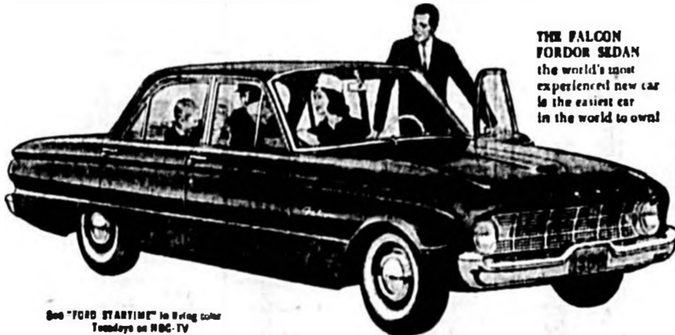
See "FORD STARTING" in living color Tomorrow on NBC-TV

FORD BUILDS THE WORLD'S MOST BEAUTIFULLY PROPORTIONED CARS