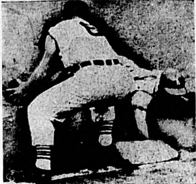
ACTION IN FIRST INNING — Wally Moon, of the Los Angeles Dodgers, dives back into first base ahead of pickoff attempt by White Sox pitcher Bob Shaw. Trying for tag is Chicago White Sox first baseman Ted Kluszewski.