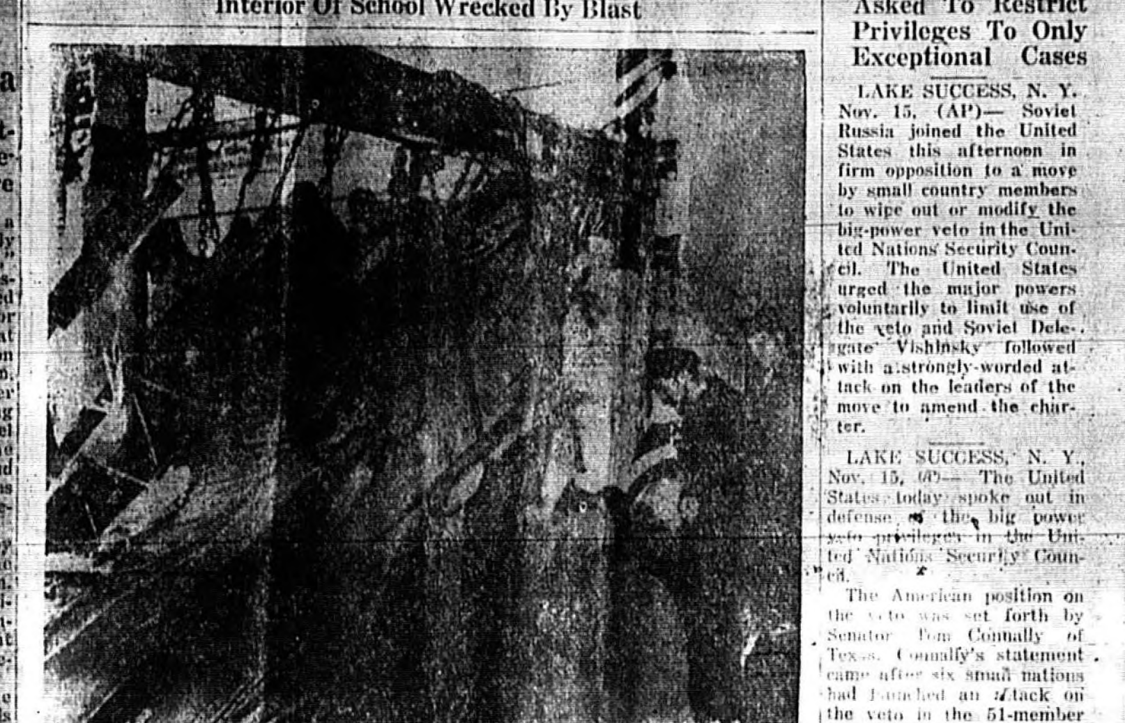
Interior Of School Wrecked By Blast

ONE PUPIL WAS KILLED and a score were injured when a boiler exploded in this school at 11:00 a.m. today, causing a portion of the building to collapse. The blast occurred a half hour before the children were to go out to lunch.