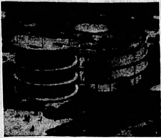
THIS ARTIST'S sketch shows the proposed design for the "Pavilion of American Interiors" which will house the exhibits of 125 manufacturers at the New York World's Fair in 1964. Negro furnishings will be a top feature.