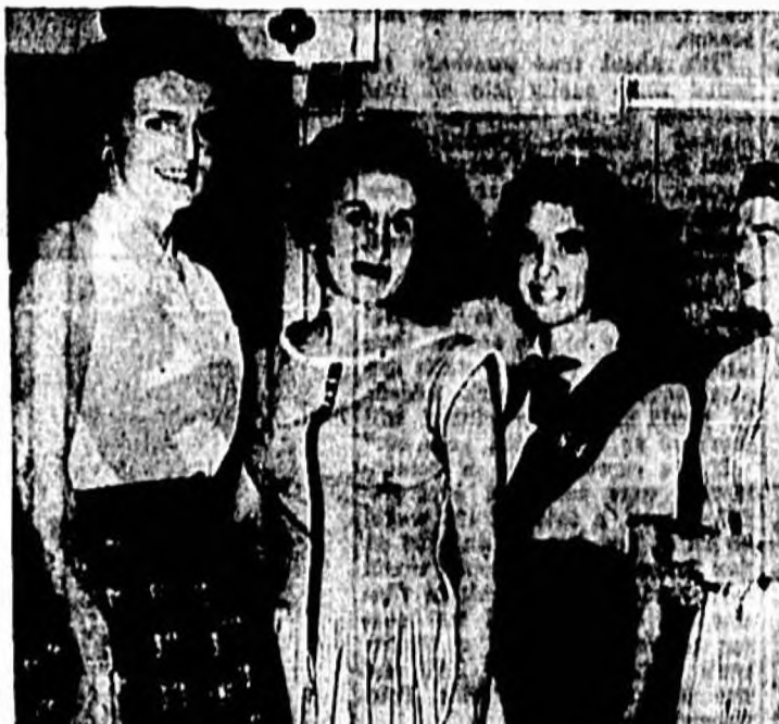
MOTHERS WERE HONORED Saturday afternoon by Troop 264 of All Souls Church. The Girl Scouts prepared the food and served their mothers.

Mother's Day, I was convinced this morning, was for the birds. That was before my little brood deposited their handmade treasures on my bed.