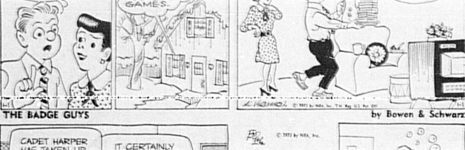
FRISCELLA'S POP by Al Vermeer