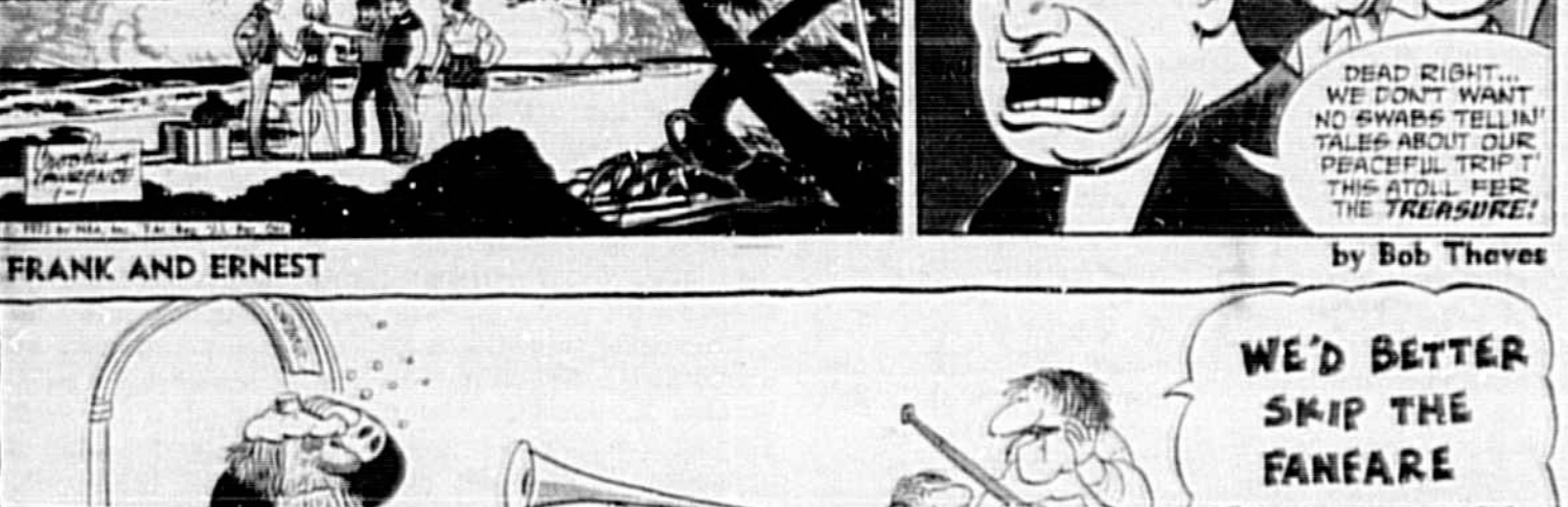
CAPTAIN EASY by Crooks & Lawrence