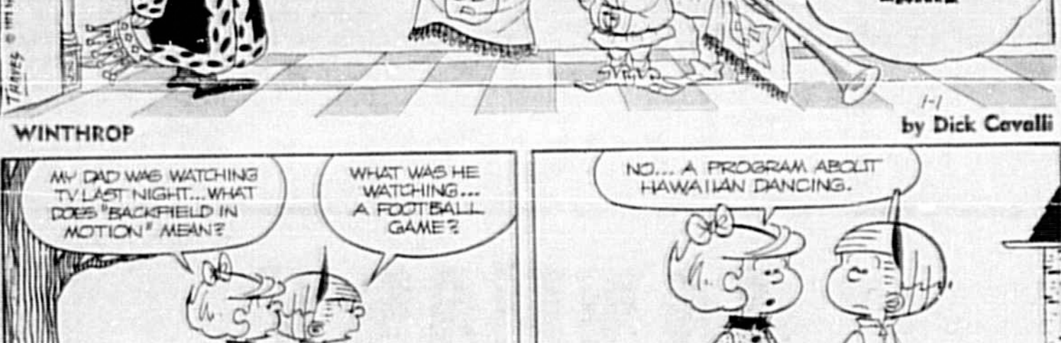
FRANK AND ERNEST by Bob Thaves