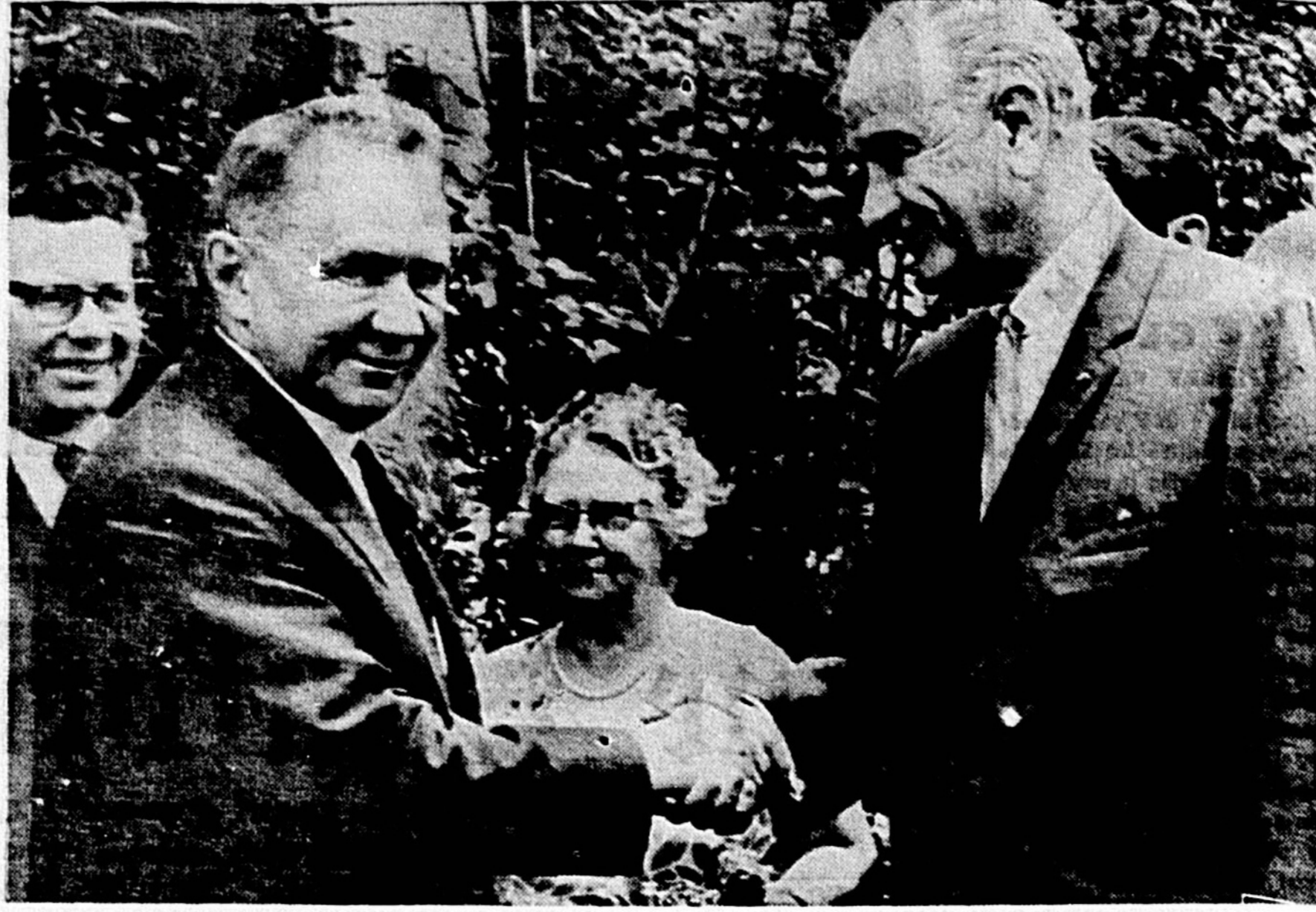
HISTORIC FIRST MEETING between Soviet Premier Alexei Kosygin and President Johnson for a "Big Two" summit conference on "substantive" world problems was also the first head-to-head talks between the United States and Soviet heads of state in six years. It began with a warm handshake and

SAIGON (AP) — South Vietnamese paratroopers and South Korean marines bore the brunt of ground fighting in Vietnam Sunday and reported killing 148 Communist soldiers. Only light and sporadic contact was reported by U. S. units conducting 21 major ground sweeps. U. S. headquarters reported 153 American air missions over North Vietnam Sunday, almost all against supply routes. At least 100 tanks and 150 American planes avoided the Hanoi-Haiphong region. The official reason given was bad weather. South Vietnamese paratroopers scored the biggest success of the day in the 2d Corps area.