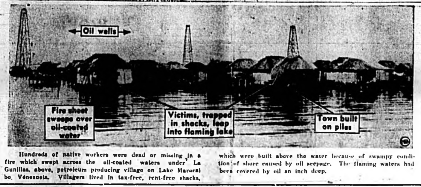
Hundreds of native workers were dead or missing in a fire which swept across the oil-coated waters under La Guantillas, above, petroleum producing village on Lake Maracaibo, Venezuela. Villagers lived in tax-free, rent-free shacks, which were built above the water because of swampy conditions there caused by oil seepage. The flaming waters had been covered by oil an inch deep.