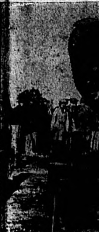
This 60th Infantry tank literally was "stumped" by the obstacles of tree trunks built by the fifth Engineers. Tank trapping was part of U. S. Army demonstration at Fort Belvoir, Va.