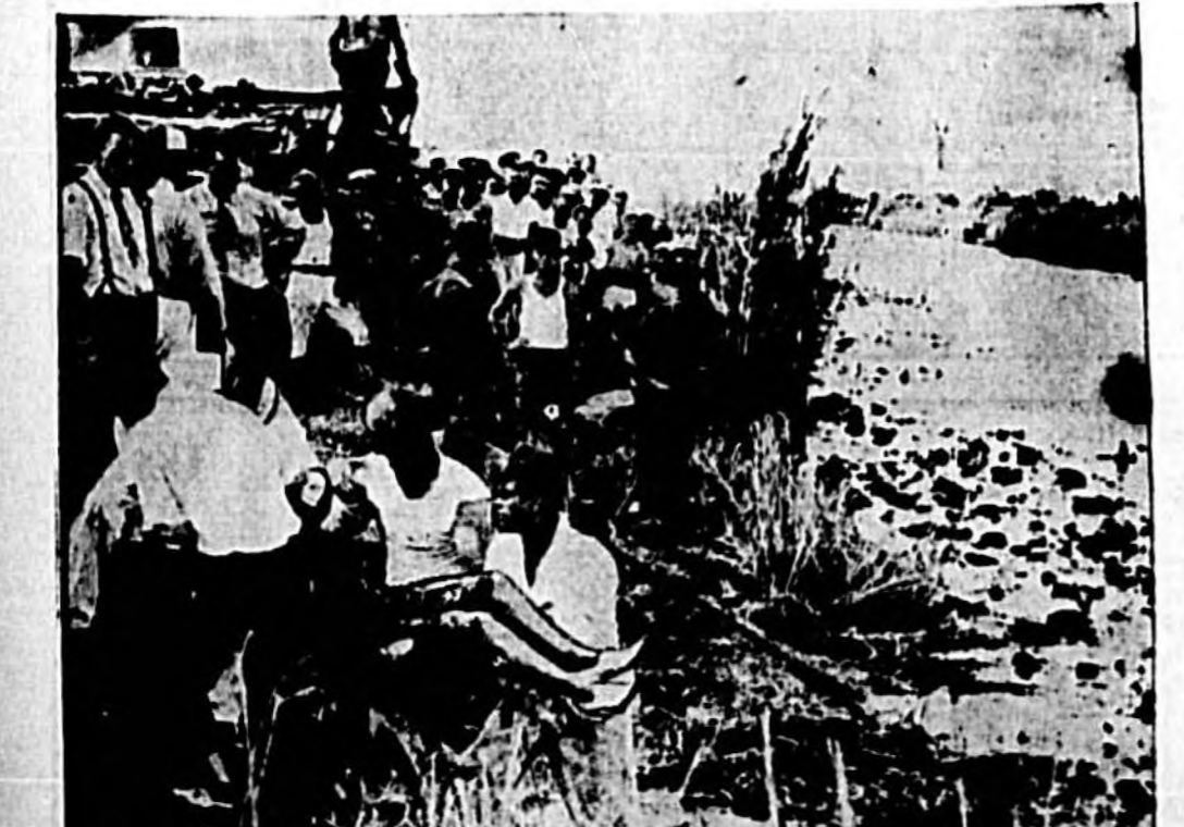
The body of a woman, one of 17 persons who perished when a Tamiami Trail Tours bus left the highway and overturned into a canal, is shown above as rescue workers brought it ashore after divers had recovered it. The tragedy, attributed to a defective wheel, was one of the worst in Florida history.