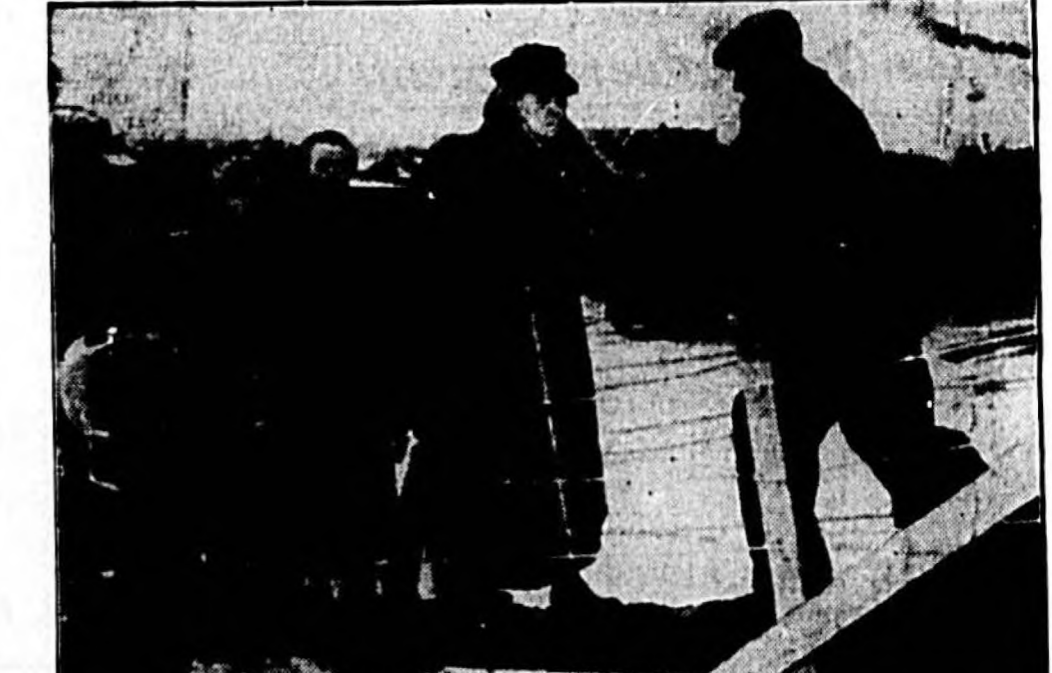
Even before the United States army high command disclosed its preparations for evacuating all residents within 50 miles of the flooded Mississippi river between Cairo, Ill., and New Orleans if necessary thousands along the "Father of Waters" had begun their flight to safer ground. Relief workers are shown helping women aboard a rescue boat at Cairo, Ill., for removal to the highlands near Wickliffe, Ky.