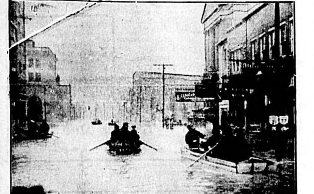
The main street of Marietta, Ohio, flooded to a depth of six feet, took on the appearance of a canal as rescue workers in rowboats went about the task of removing marooned refugees from second-story floors.