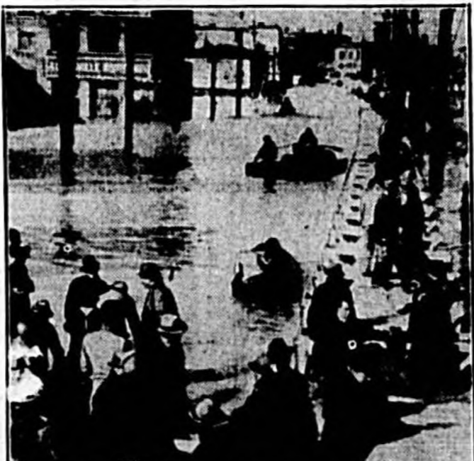
Still checked with high water, principal streets in Louisville, Ky., are being spanned with pontoon bridges so that refugees can walk from flood-surrounded buildings to places where rescue boats can evacuate them. Workers are shown hurrying construction on Baxter.