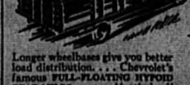
Longer wheelbases give you better load distribution. . . . Chevrolet's famous FULL-FLOATING HYPOID REAR AXLES are geared for the load!