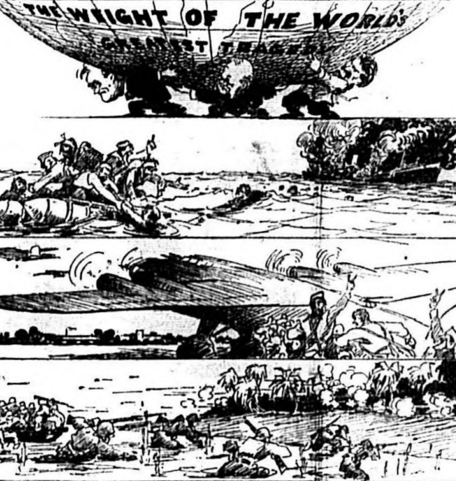
IF ALL THE BEST OF US SACRIFICED EVERYTHING TO BUY MORE BONDS WE COULDN'T EVEN TRY TO SCORE.