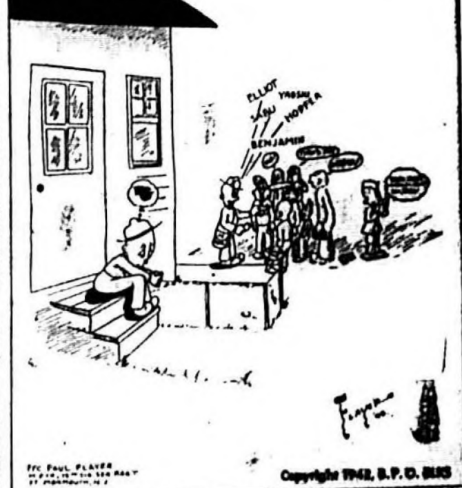
LIFE'S DARKEST MOMENTS