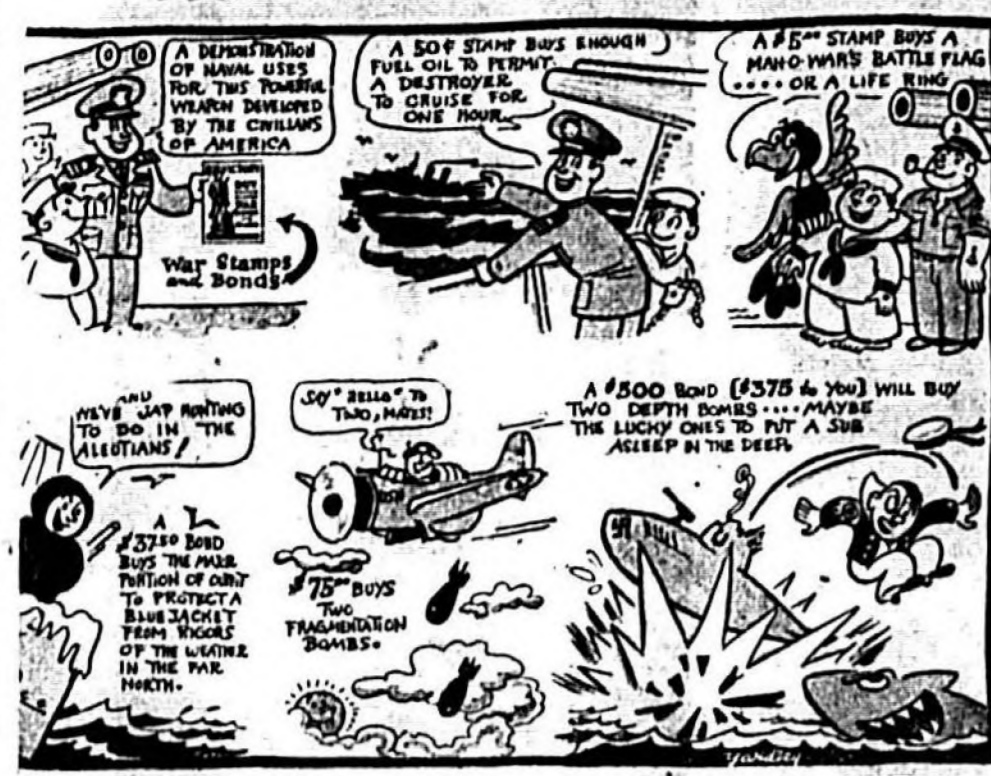
'Write 'em a Letter'... More Reduction Asked In Long Distance Calls