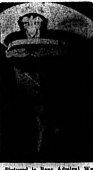
Pictured is Rear Admiral Wm. H. P. Blandy, who has just returned from an extensive 20,000-mile inspection tour of naval installations in the Pacific. He declared that U. S. forces now hold the balance of striking power in the western Pacific. This is an official U. S. Navy photo.