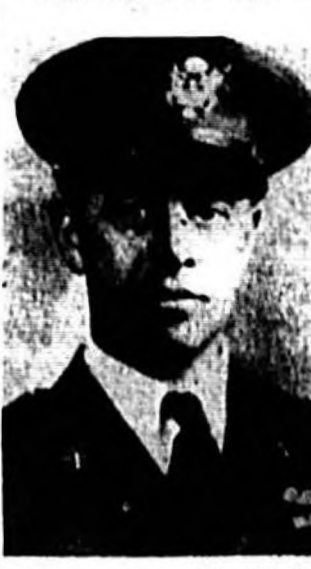
According to a statement from General MacArthur's headquarters, the Pacific Air Force has been reorganized to meet the demands of the war.