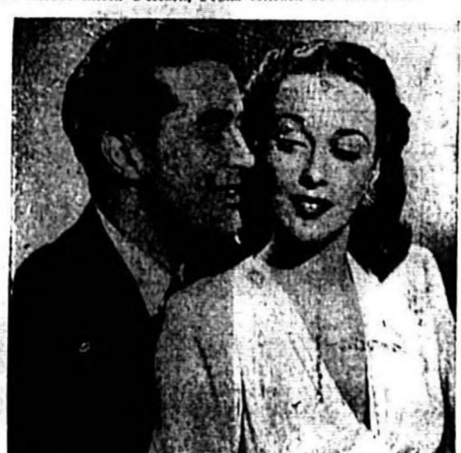
BRIGHT EYES—There's dynamite in that comely glance that lovely Patricia Morison has turned in for the benefit of Ray Milland who co-stars as the husband of Betty Field in Paramount's "Are Husbands Necessary?" That comedy film of domestic bliss, and bluster opens Friday at the Ritz Theatre. It's one of the year's liveliest laugh fests.

Ground or rolled peanut brittle gives a grand flavor to tapioca pudding. No sugar is then needed in the pudding. Peanuts have a high content of Vitamin B1.