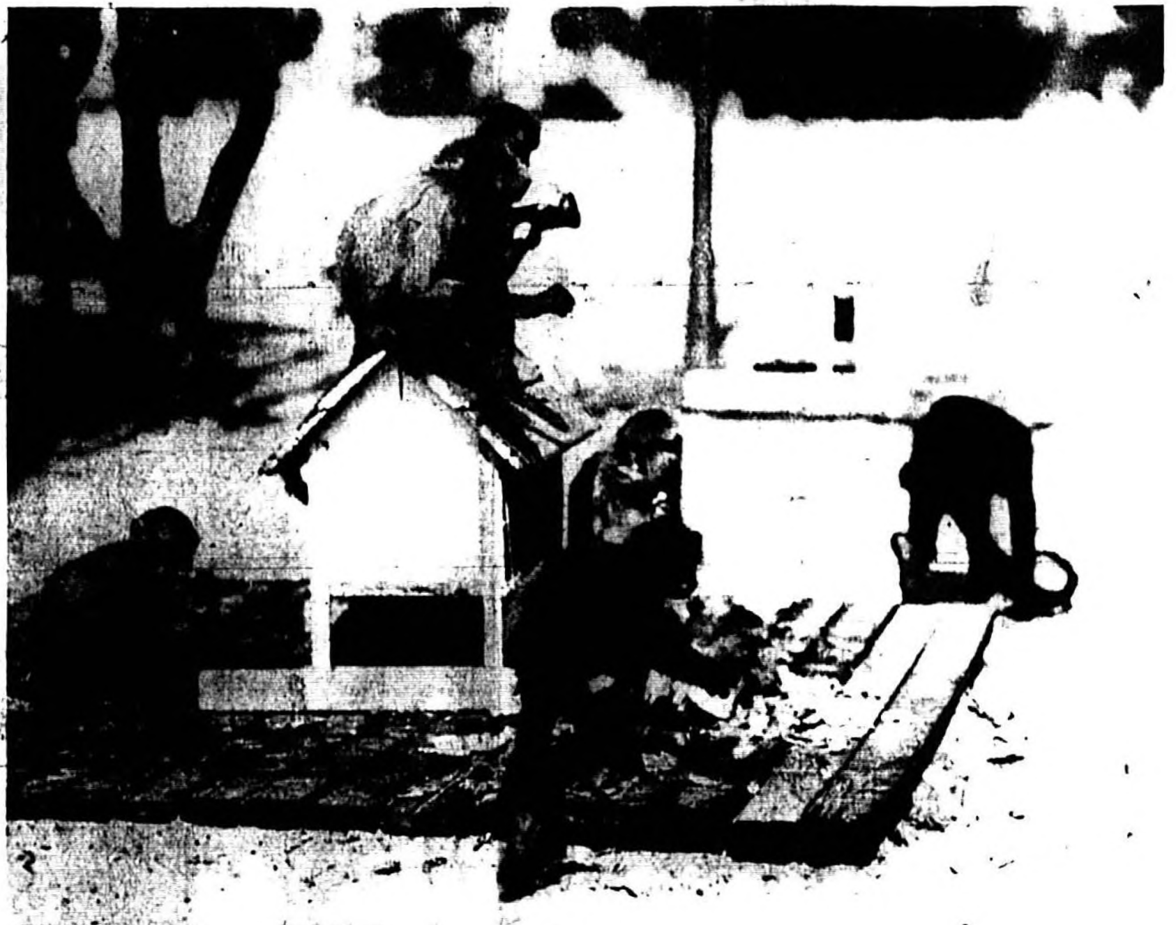
How We Do Love Easter Eggs!