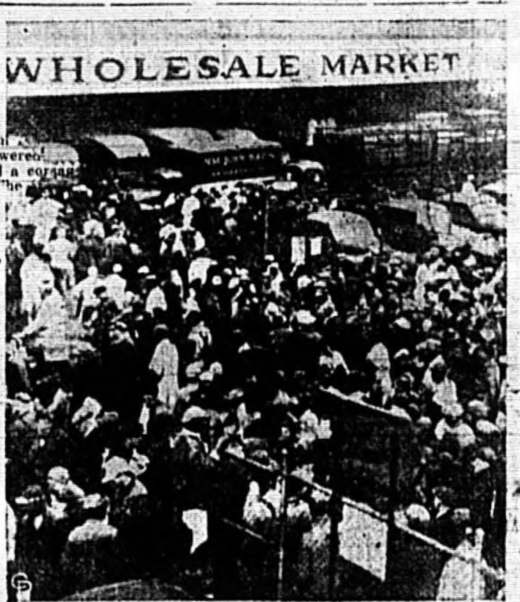
SHOWN RETURNING TO WORK are some of the four-thousand Wilson and Company employees who left their jobs for thirty minutes to attend a rally in front of their union headquarters in Chicago protesting the discharge of some two hundred timekeepers.