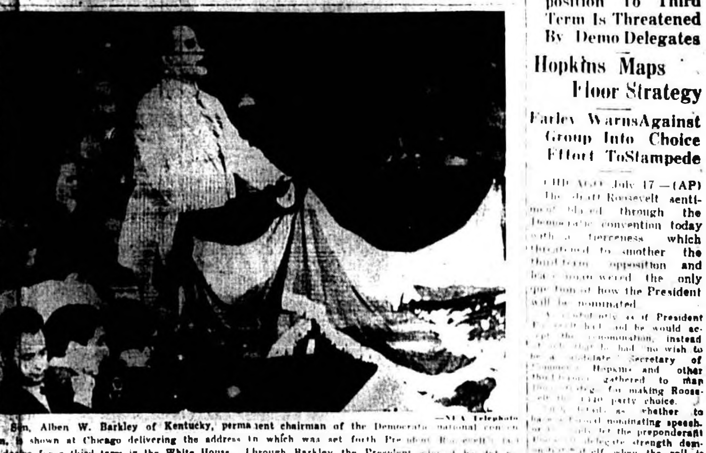
Sen. Alben W. Barkley of Kentucky, permanent chairman of the Democratic national convention, is shown at Chicago delivering the address in which was set forth President Roosevelt's call for a third term in the White House through Barkley the President asked he did not desire to continue in office.

President Plans Industries For Nation's Defense Chief Executive Out- lines Detailed Re- port To Council