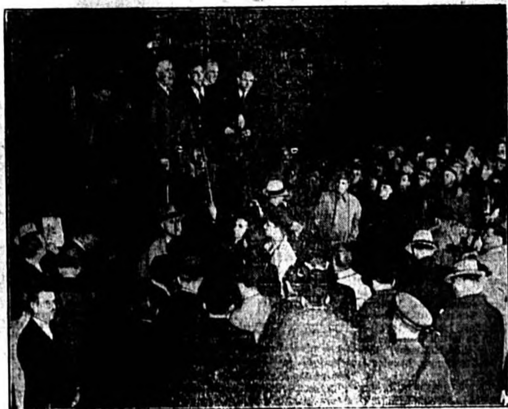
Returning to Washington from his vacation cruise in Florida waters, President Roosevelt stopped at tornado-stricken Gainesville, Fla., and expressed his sympathy for the victims in their spirit of rehabilitation. He is shown addressing the crowd from the platform of his special train.