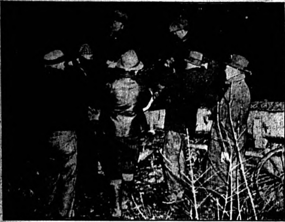
An old-fashioned farm wagon was the only vehicle capable of negotiating the steep, rough mountainside to remove the bodies of 11 persons who perished in the crash of the TWA airliner, Sun Racer near Unifentown, Pa. Toiling by flashlights, rescue workers are shown lifting a body from the wreckage to the wagon.