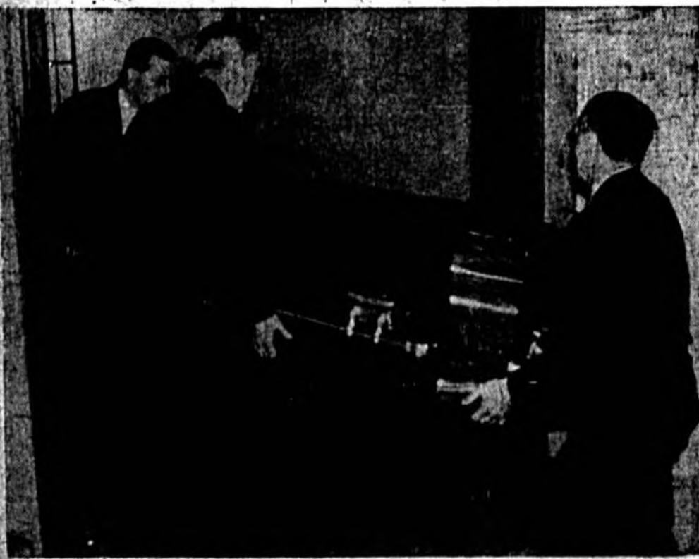
Here is the last scene in the terrible drama that cast Bruno Hauptmann as chief actor. In the dead of night and with greatest secrecy, mortuary attendants took the body of the executed killer of kidnaped Baby Lindbergh to Fresh Pond crematory in Queens, Long Island, and attempted to smuggle it into the rearing furnace before spectators could follow them. But an Associated Press photographer saw them carrying the coffin—and this exclusive picture resulted.