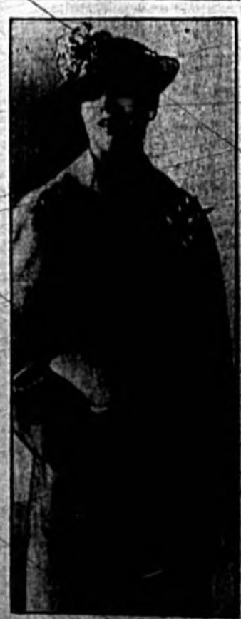
Mrs. Franklin D. Roosevelt is shown wearing the suit she has chosen for Easter. A double-breasted full-length her coat of Etienne blue is worn over a blouse of Dubonnet red and a navy blue white checked tweed skirt. The hat is navy blue straw with white and Dubonnet flowers.