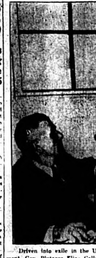
Driven into exile in the United States by the Mexican government...