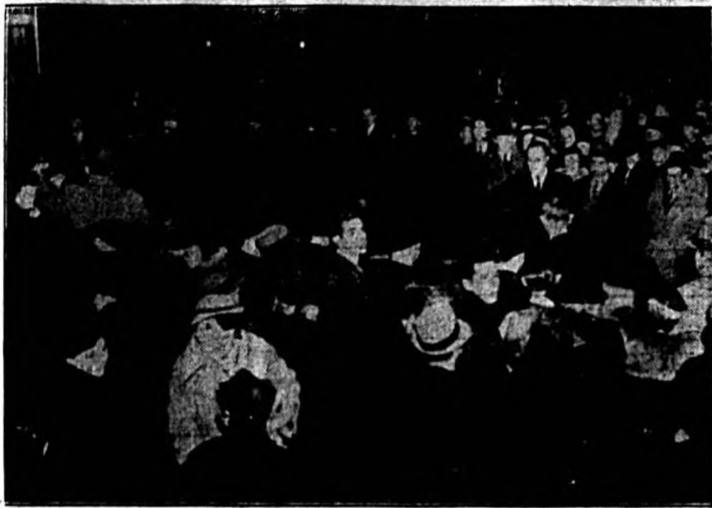
In death, as in life, Bruno Hauptmann was a magnet for all eyes. A crowd of the curious is shown surrounding a mortuary in New York as a hearse bearing his remains arrived from Trenton, N. J., where he was electrocuted for the kidnaping and murder of Baby Lindbergh.