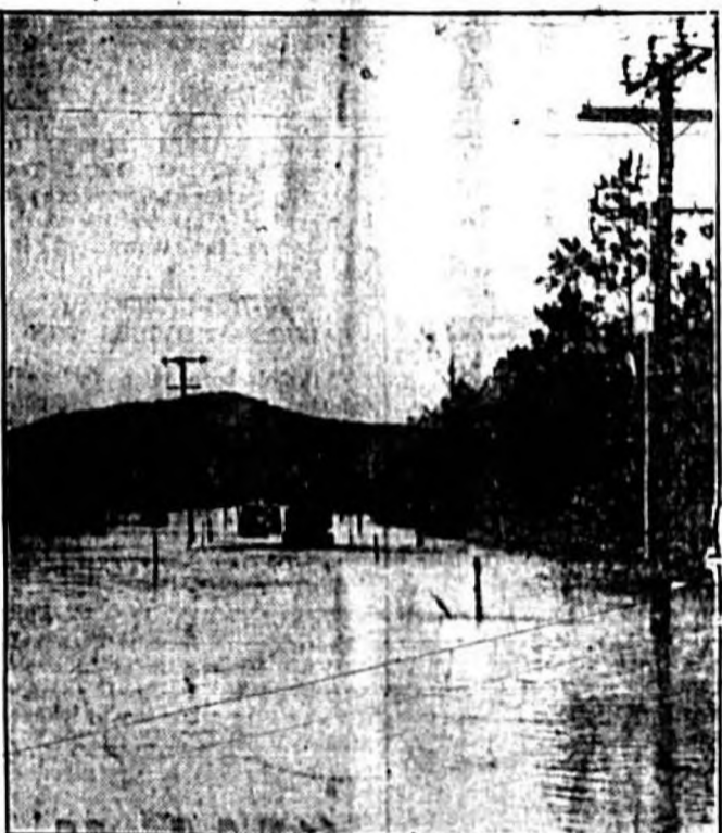
Highways in many sections of the south were covered deep in water as swollen streams reached flood stages in the wake of heavy rain. This picture shows traffic plowing through the overflow from the Coosa river near Gadsden, Ala.