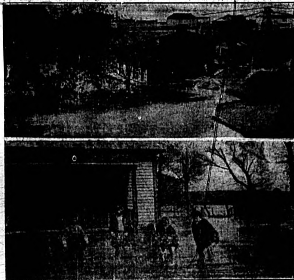
The tornado-wrecked South had floods added to its plight as swollen streams inundated many sections. The Congaree river swept over sandbags and invaded the Broad River Power company building (top) at Columbia, S. C., necessitating removal of machinery. The boys shown below didn't have to go to the river to fish at Columbia. The river came to their porch, so they waded out with fish nets.