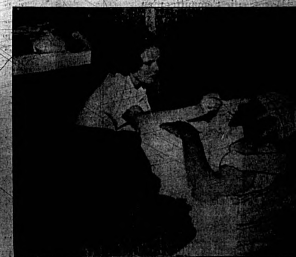
Rescue workers are shown ministering to the injured inside the Tupelo, Miss., apartment, which was quickly converted into an emergency hospital following the destructive tornado. The girl shown on the cot at the left is dead. More than 100 were killed and 500 injured when the trailer hit Tupelo.