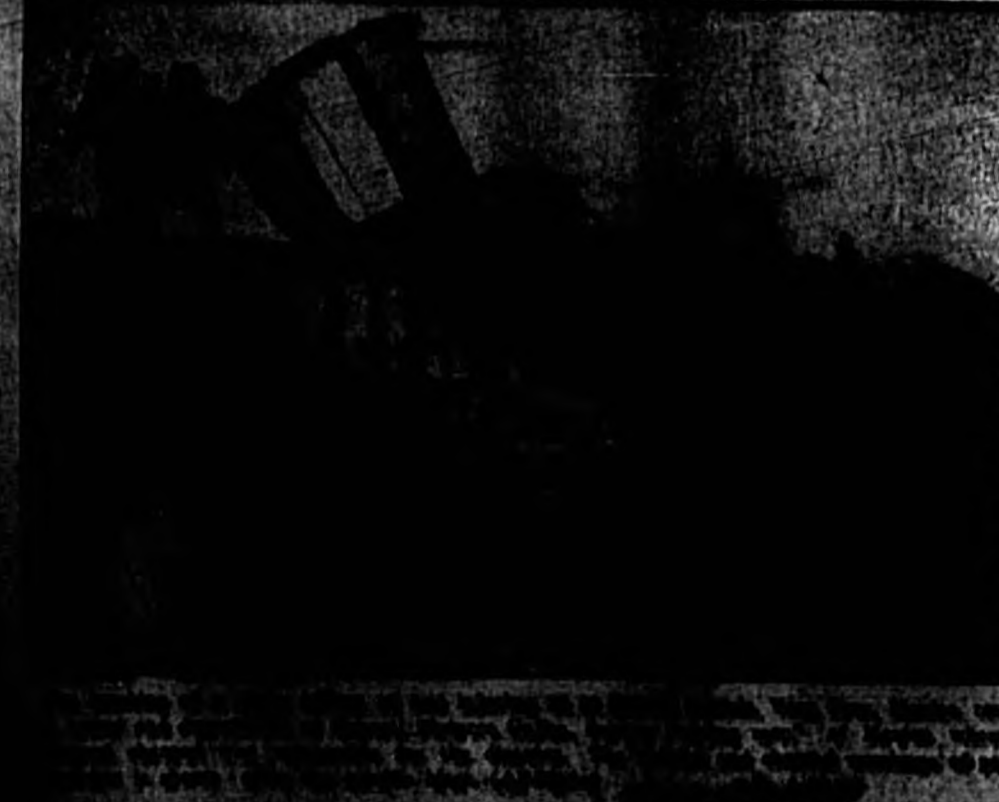
There are 1000 prisoners in the Kansas State Penitentiary at Lansing.