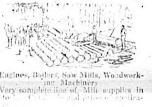
Engines, Boilers, Saw Mills, Woodworking Machinery. Very complete line of Mill supplies in stock. Call on us for all your mill needs.