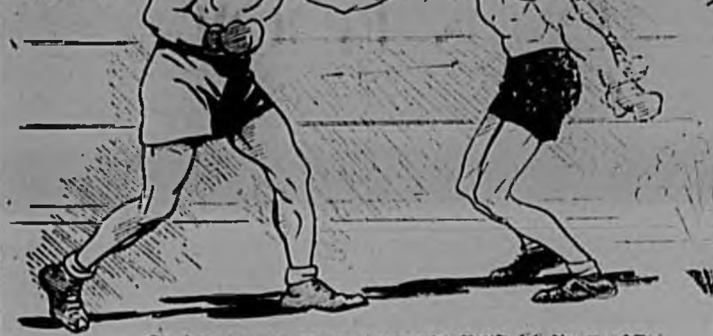
IF CARNERA'S RIVAL SECONDS FIND IT NECESSARY TO HURL IN TOWELS THEY SHOULD ENCLOSE A BRICK TO ADD AN AIR OF FINALITY TO THE SCENE.

A FEW SUGGESTIONS TO MR. CARNERA ON HOW TO PUT CONVICTION IN HIS K.O. RECORD.