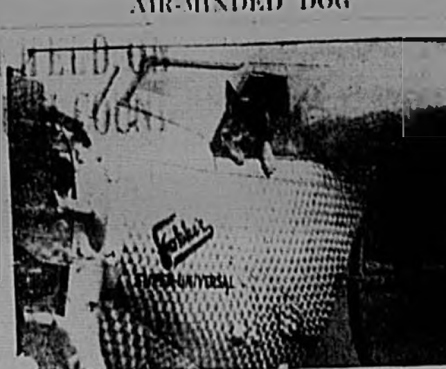
ROOSEVELT FIELD, Apr. 26 (AP)—An air-minded dog today was the subject of a story.

ATLANTA, Ga., Apr. 26 (AP)—A 17-year-old boy killed his intoxicated father.