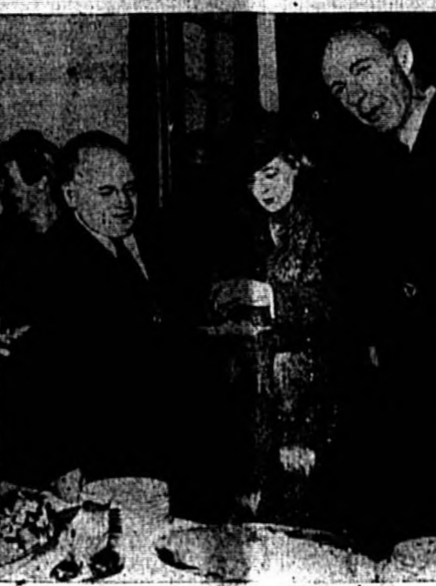
Host and two distinguished guests are shown at the reception at the Russian embassy in Washington in honor of the 24th anniversary of the formation of the Red Army. Left, is Russian Ambassador Maxim Litvinoff. With him are Lord Halifax, the British ambassador to the U. S., and Lady Halifax.