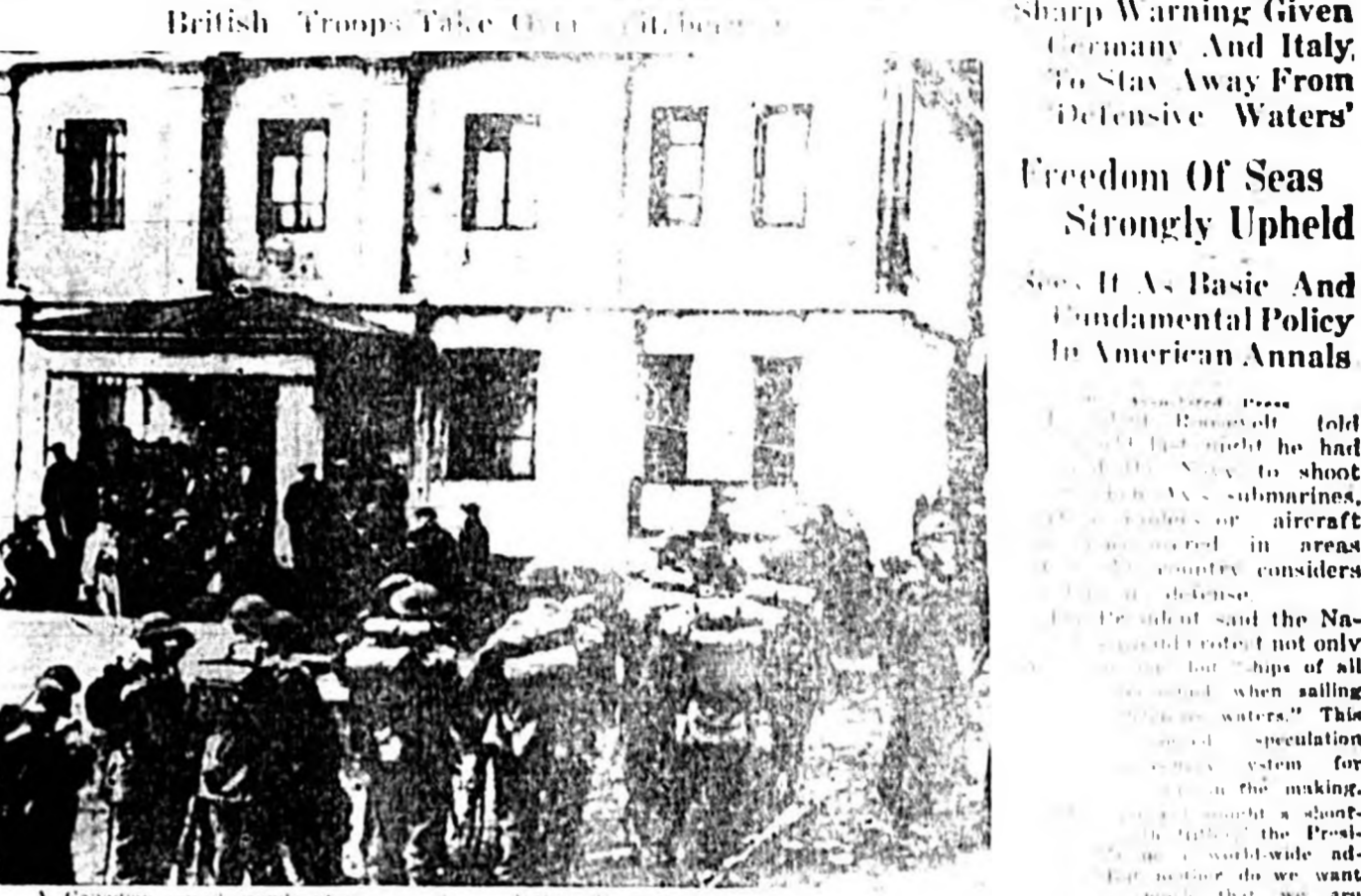
A Canadian guard stands at the entrance of a building in Spitzbergen, Norway, after an Axis attack. The scene shows the entrance to the building, with a guard standing in front of it. The building appears to be a military installation or a government building.