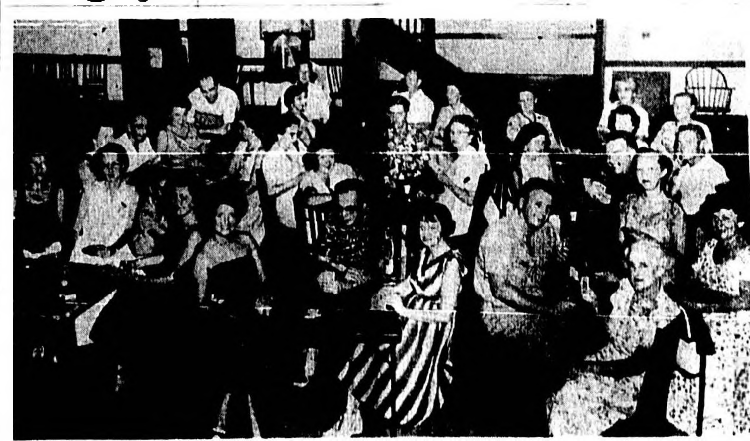
EVERY WEDNESDAY night is duplicate bridge night in Sanford this summer with plans underway for the group to become affiliated with a national organization...