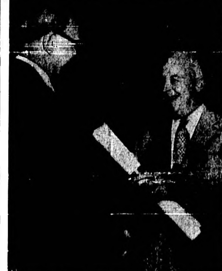
PRESIDENT DWIGHT D. EISENHOWER smiles his approval as he hands Lewis Strauss his commission as new chairman of the Atomic Energy Commission during ceremonies at the White House. Strauss, who replaces Gordon Dean, was sworn in shortly before.