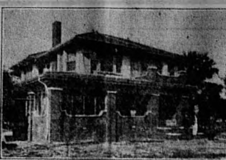
This two-story home containing 11 rooms was recently finished at a cost of $35,000. The residence, one of the finest in Sanford, is located on Silver Lake. With furnishings and a three-car garage, the place represents an investment of approximately $50,000, according to contractors.