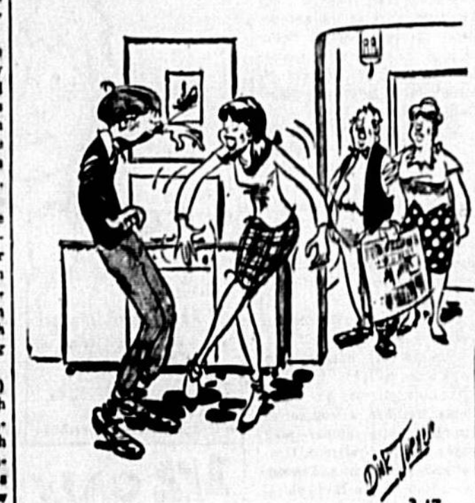
By Dick Turner