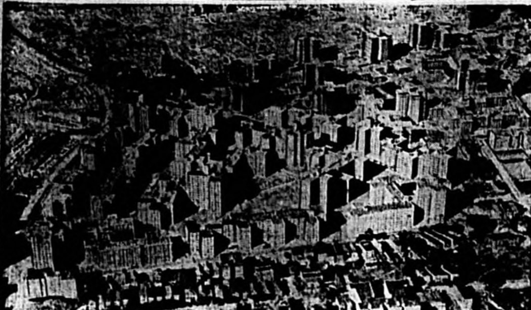
Striking airview above shows construction partially completed on Parkchester, the City Within a City being built in New York's borough of the Bronx. When finished, Parkchester's 51 buildings, containing 12,273 apartments, which will rent at about $13 per room per month, will have cost their owner, the Metropolitan Life Insurance Company, close to $50,000,000.