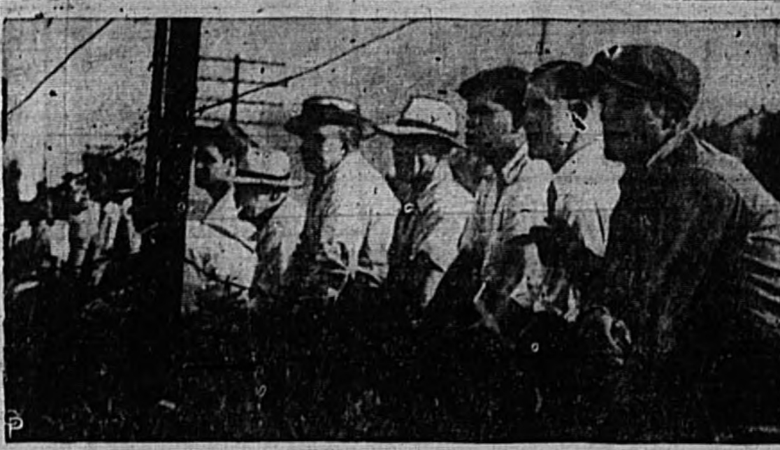
MINERS WHO WALKED OUT of a mine at Muse, Pa., in protest of passage of the Taft-Hartley labor bill, line up along a broken fence to watch a sandlot ball game while the mine remains idle. The walkouts began shortly after the controversial labor measure became law and some 10,000 miners went on strike in Alabama, 8,000 in Pennsylvania, 3,000 in West Virginia and Ohio, and 1,000 in Virginia.

In Washington, to relieve congestion during the war, a decentralization program transferred many federal offices into the field. The government now wants them to "recentralize." Congress has been asked for funds to bring the boys home, and the matter is being considered in connection with the Independent Offices Appropriation Bill.