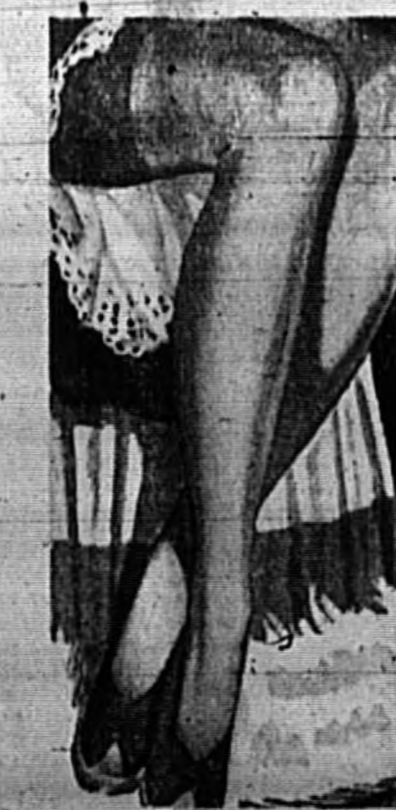
STOCKINGS STAY LOVELIER, SHEERER-LOOKING!

Vel keeps stockings sheerer-looking and lovelier longer than soap can. So you wear stockings longer when you wash them with Vel! No soap can stick to and coarsen stocking threads when you use Vel. No soap-fading! VEL is the trademark of the Colgate-Palmolive-Peet Company.