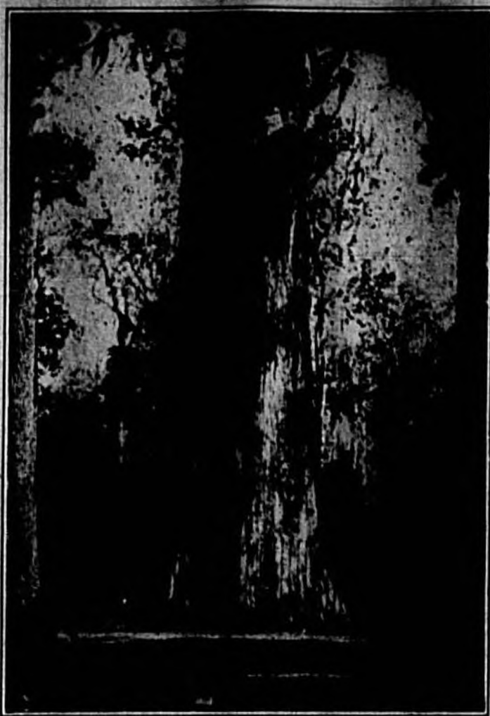
The biggest tree in Seminole County and probably in the eastern part of the United States is located at Longwood. It is said to be 3,500 years old, is 125 feet high, and has a circumference at its base of 47 feet.