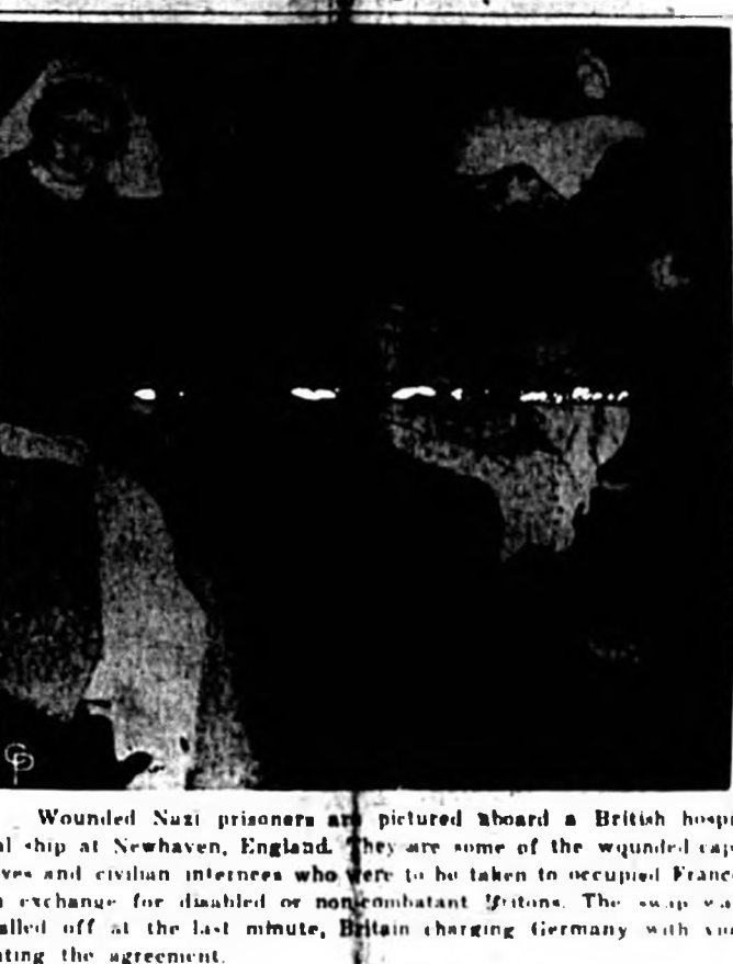
Wounded Nazi prisoners are pictured aboard a British hospital ship at Newhaven, England. They are some of the wounded captives and civilian internees who were to be taken to occupied France in exchange for disabled or non-combatant Britons. The swap was called off at the last minute, Britain charging Germany with violating the agreement.