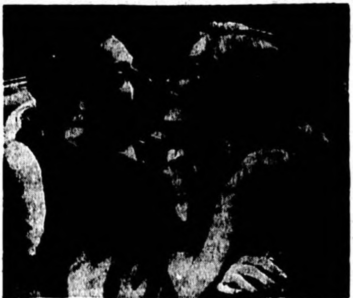
"The Devil's Hairpin" Vista-Vision-Technicolor sports car racing drama starting Sunday at the Movieland Ride-In Theatre, romantically teams Cornel Wilde and lovely Jean Wallace.

It's one thing to ask an actor to dial the phone, and quite another to ask a dog to do it.