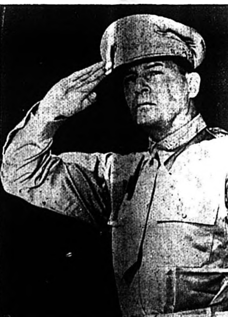
General Douglas MacArthur has been designated by President Truman as Supreme Allied Commander to accept the surrender of all Japanese Army and Naval forces and will govern Japan following the formal surrender.