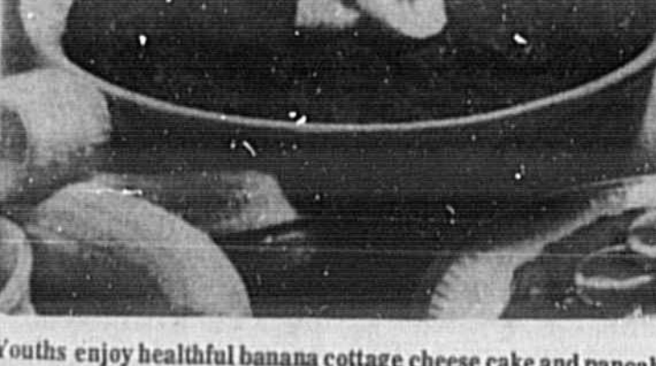
Youths enjoy healthful banana cottage cheese cake and pancakes.

In a large bowl, beat cottage cheese until smooth. Add eggs, one at a time, beating well after each addition. Blend in oil, vanilla and bananas. Mix together flour, sugar, wheat germ, baking powder, cinnamon, nutmeg, salt and baking soda. Blend into banana batter. Turn into a well greased 1 1/2-quart baking dish.