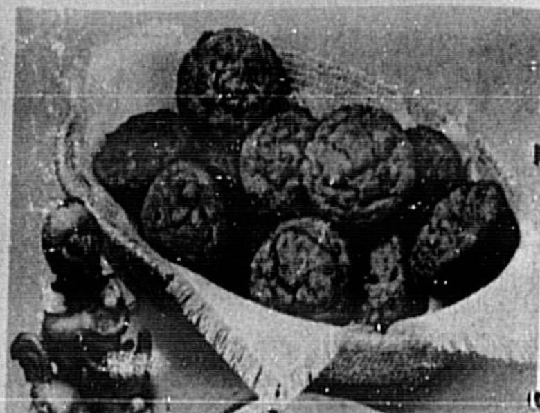
PEANUT BUTTER MUFFINS These tasty snacks are ideal to put into the back to school lunches. They aren't greasy and are easy to make.

type, particularly large pieces, two pounds or more, saves money and tastes good. And the large size leaves some for next day. That's important for lunch. Another way I also save is by cutting up my own chickens rather than buying them cut up. This saves six cents a pound, on a three-pound chicken that is 18 cents." "Awful, simply awful" is the way Beverly Sperry characterizes the cost of food.