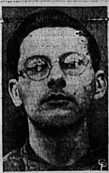
ADOLF HITLER'S personal physician, Dr. Karl Brandt (above), and 34 other defendants were found guilty by a United States tribunal in Nuremberg, Germany. They were tried on charges of participation in and responsibility for medical experiments on the inmates of concentration camps.