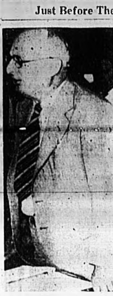
Just Before The Battle Started