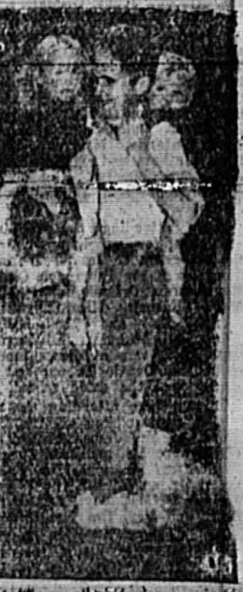
A FATHER ferries his two children across a flooded street after a 15-inch water main pipe broke in Manhattan, N. Y., flooding a 15-block area. Hundreds of families were deprived of water and many New York City residents were forced to wade through the streets in their bare feet.

Under official rules of the game, sponsored by the American Wildlife Institute and Lakes and Leagues of America, as many as ten casters may be in play at ten different spots, casting at ten different targets. Rules vary with bait and fly casting.