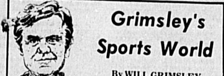
Grimsley's Sports World

second in the state only to Palm Beach. Defensively, the Raiders are holding foes to 7.2 game.