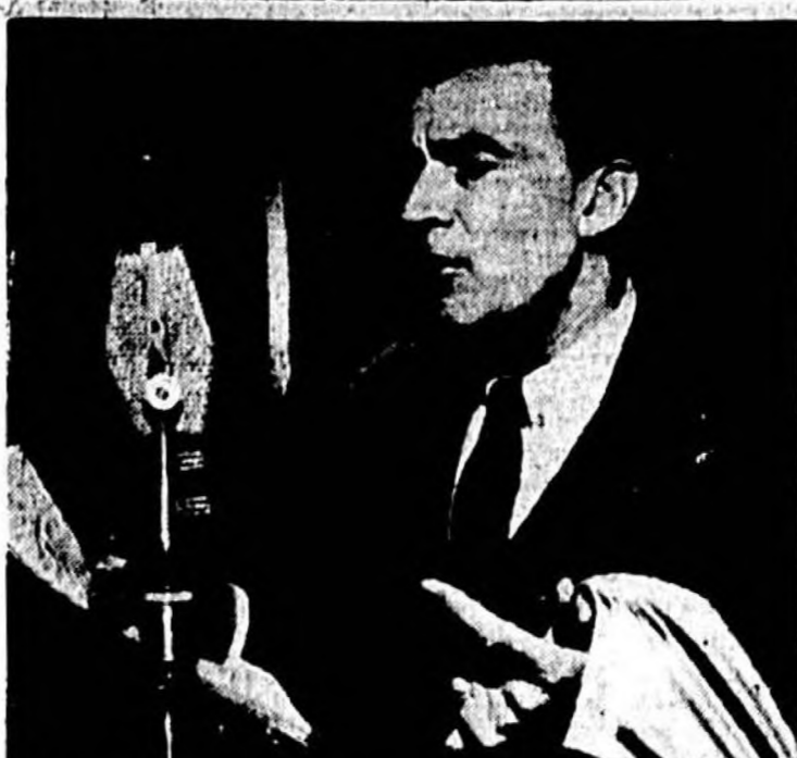
WALTER PIDGEON, playing the part of Dr. Andrew Manson in "The Citadel," is shown here speaking in his own defense during a trial for malpractice.