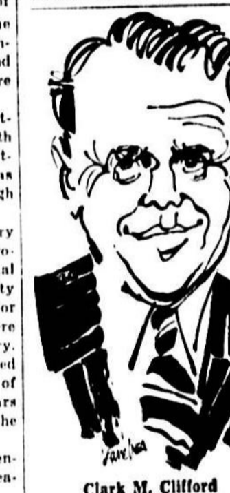
Clark M. Clifford