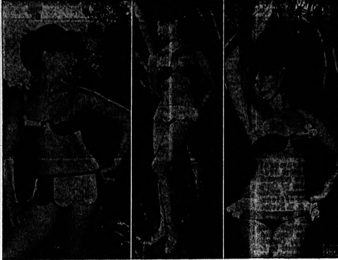
MAXIMUM MINIMUM — For those who can stand the exposure to sun and stars, there are attractive swimsuits on the market for next summer's beach excursions. These are three Paris-designed models by Hesa of Allentown. They are all of stretch latex material with orna-