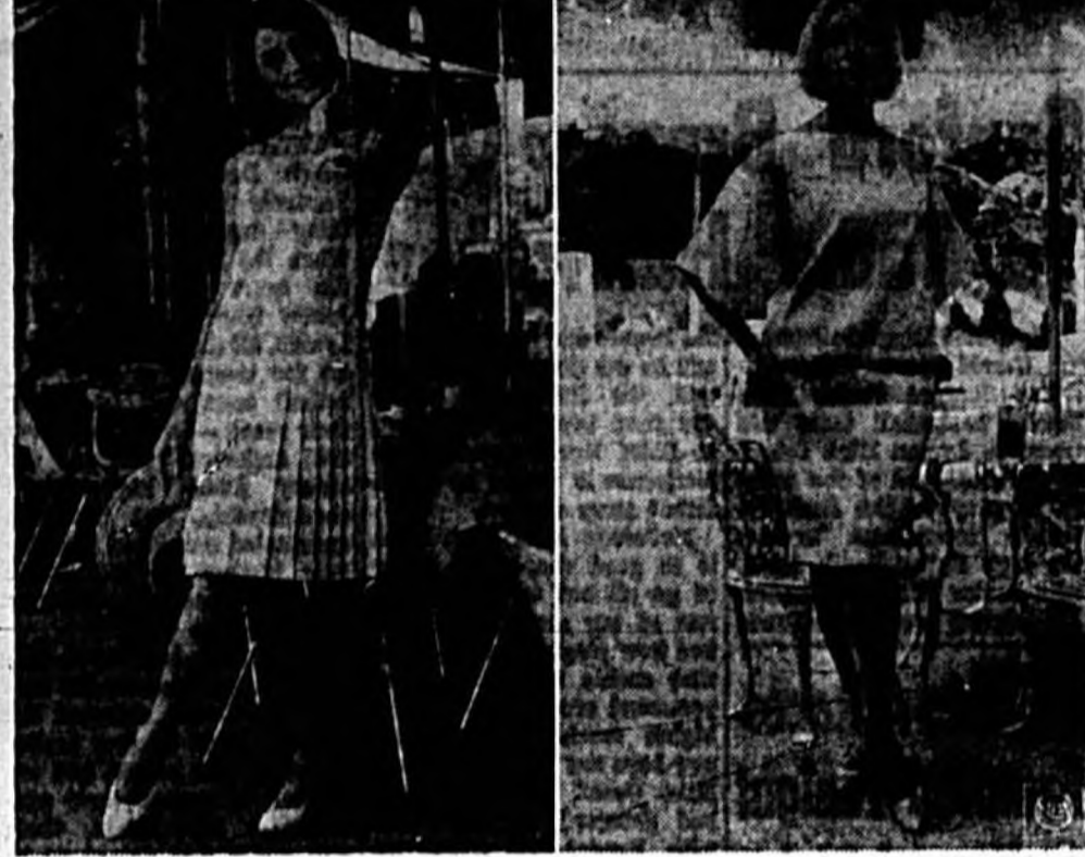
CALIFORNIA DESIGNERS have captured the youthful mood of today's fashion trend. Dacron polyester and cotton blend to make the white pin-striped blouse shirting used in the sleeveless shift (left) by Miss Pat. The shift is slightly contoured at the hip with a pleated flounce. Dacron and rayon pink treebark crepe blouson dress (right) has washability and shape retention built in. Designer, Dominique, shapes this dress high and wide at the neck, full and straight at the elbow-length sleeves.