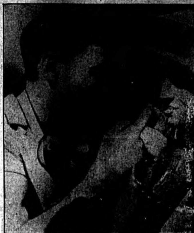
Weary but happy, Lee Meyer beams as friends congratulate him for winning the Indianapolis automobile race in the record-breaking time of four hours, 55 minutes. He covered the 500 miles at an average speed of 102.042 miles per hour.