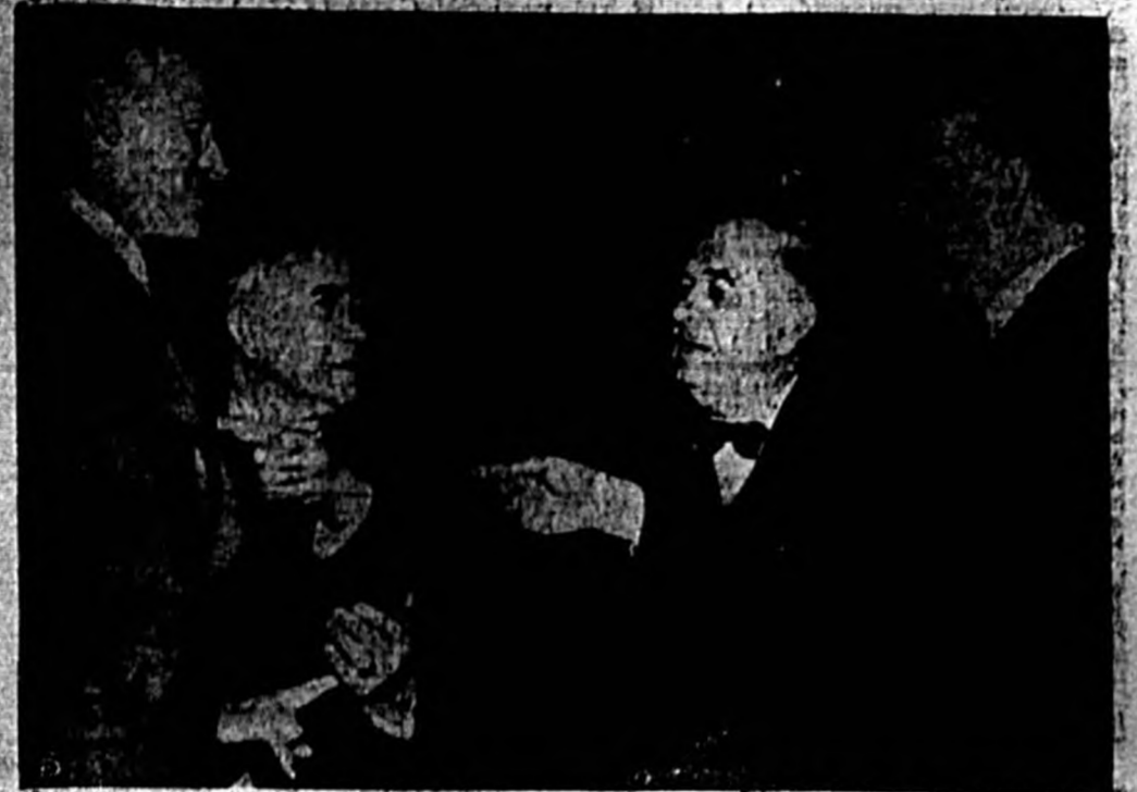
Following 50-37 Senate vote on bill permitting arming of American merchant ships and their passage through combat zones, two Democratic Senators who voted "for" and two who voted "against" carry on their debate outside the Senate chamber. Left to right: Senators Tydings (tyrant), Barkley (foe), Connally (foe) and Clark (tyrant).