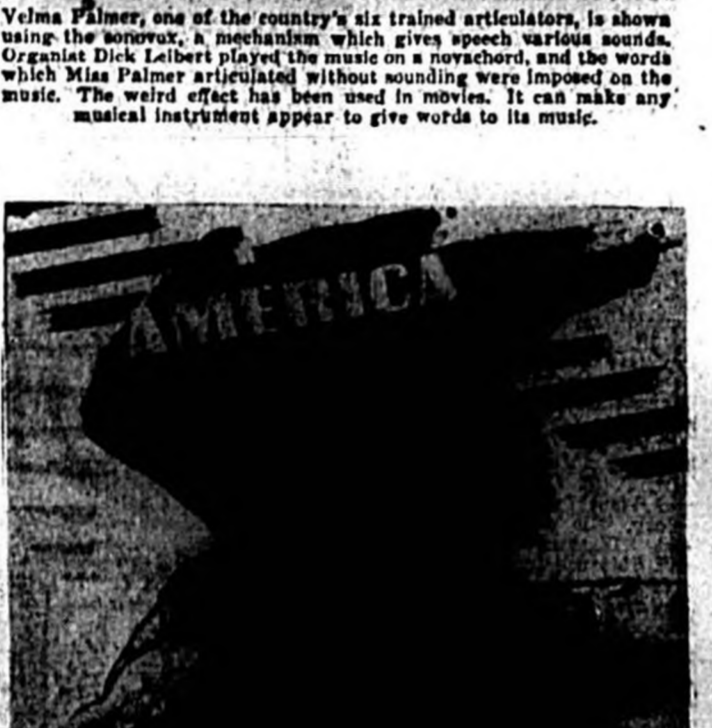
Delivered by Herbert Matter, this lecture for Civitan Defense Week was made by the Office for Emergency Management in Washington from an aerial photograph. Jerry, the American state which posed for the picture, is a resident of Washington's National Biological Park.