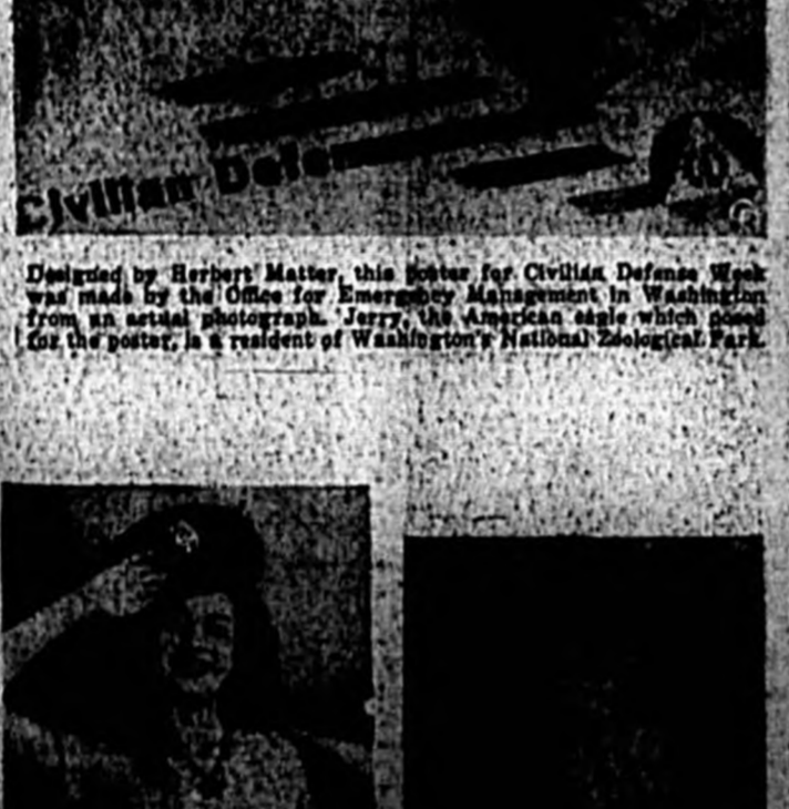
Delivered by Herbert Matter, this lecture for Civitan Defense Week was made by the Office for Emergency Management in Washington from an aerial photograph. Jerry, the American state which posed for the picture, is a resident of Washington's National Biological Park.