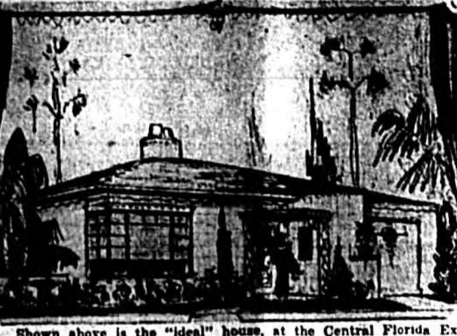
Shown above is the "ideal" house, at the Central Florida Exposition in Orlando. While the fair is in progress, Feb. 21-Mar. 1, this will be one of the features at the fairground. Each night a Spring Style Show will center around this house, as models will walk out from it, through the auditorium, on elevated platforms, displaying latest styles for fallfrogs. The style show is free.