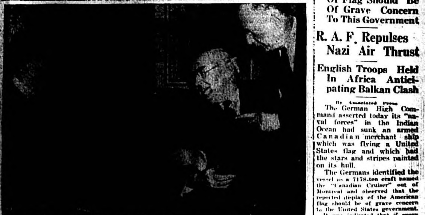
Here are the four leading opponents of H. R. 1776, otherwise known as the Lend-Lease bill, at an impromptu conference outside the Senate chamber. Left to right: Senators Bennett, Champ Clark, Hiram Johnson, Arthur Vandenberg, and Burton K. Wheeler. Each has attacked the bill from the floor.