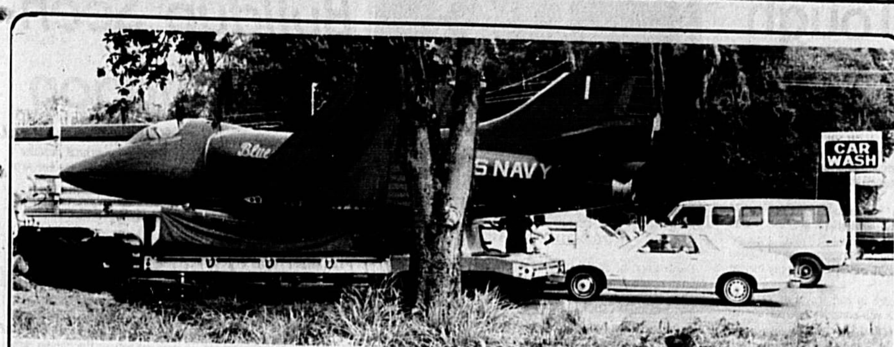
CAR WASH ENTERS JET AGE Car wash at Third Street and French Avenue was visited by a 'big customer' today -- Navy A-4 jet in town for this weekend's air show at Sanford-Central Florida Airport.