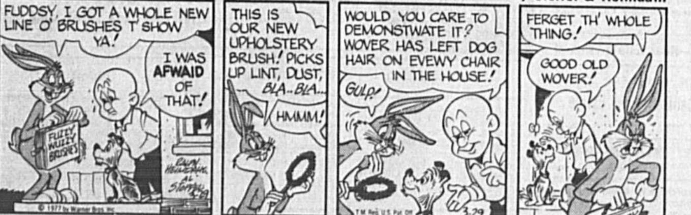
BUGS BUNNY by Stoffel & Heimdal