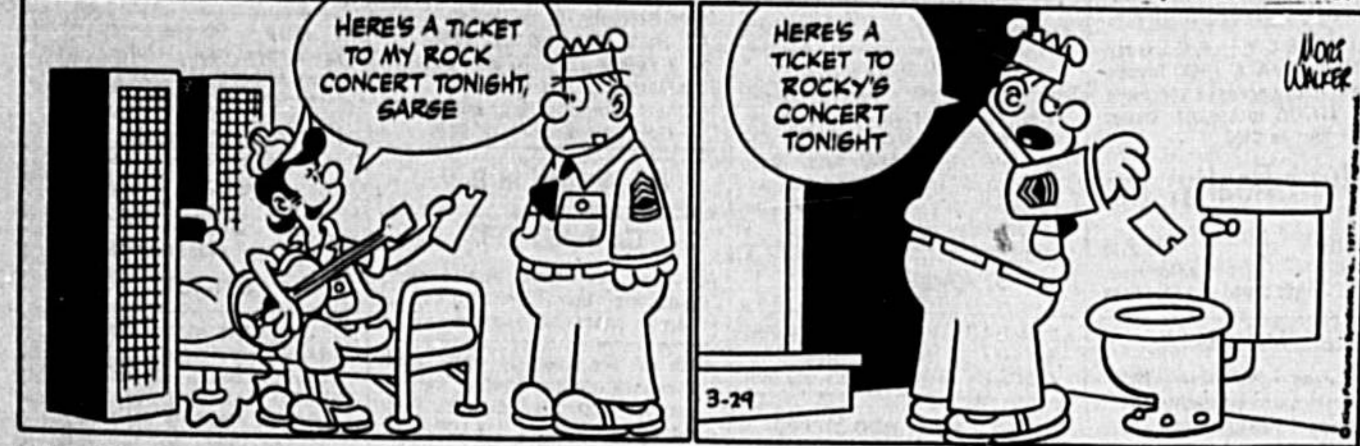
BEETLE BAILEY by Mort Walker