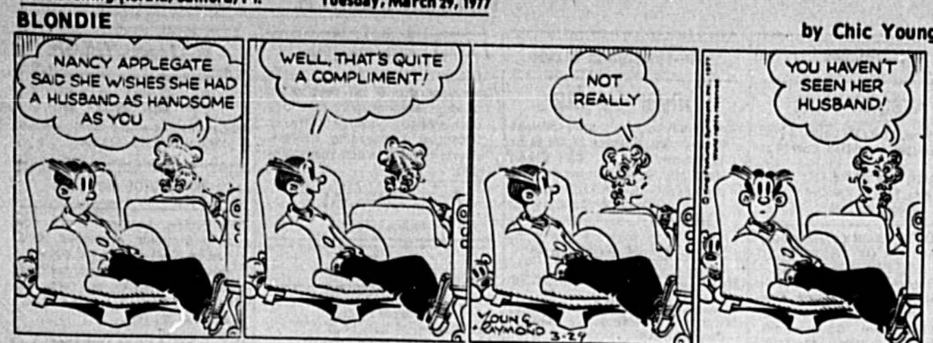
BLONDIE by Chic Young