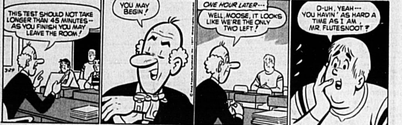
ARCHIE by Bob Montana