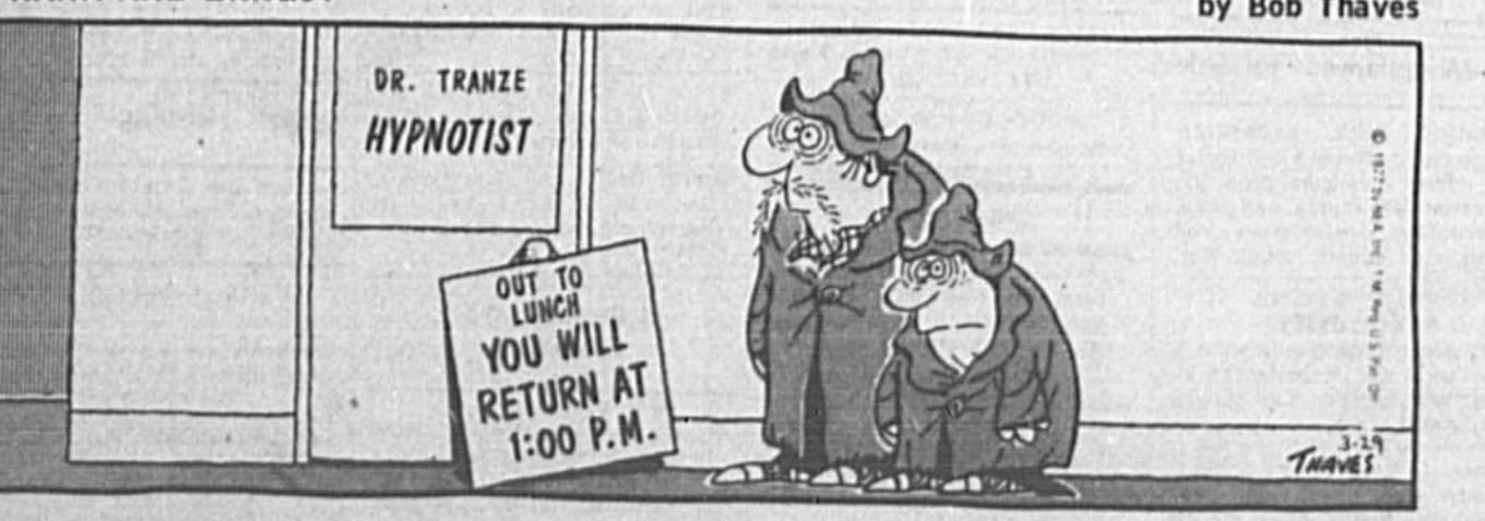
FRANK AND ERNEST by Bob Thaves