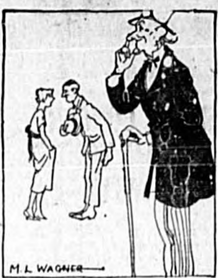
When a young fellow has a gal on the string, it's next to impossible for him to remember the text of a sermon.

mid summer season must depend on other states, for fresh vegetables, or revert to the tin can for all that is used.