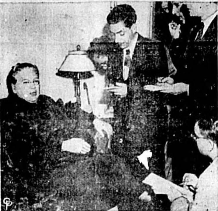
FOLLOWING A VISIT with Mrs. Oksana Kosenkina, which was made at the latter's request, Countess Alexandra Tolstoy talks to reporters in Roosevelt Hospital, New York. The Countess reported Mrs. Kosenkina as saying she is "suffering miserably," adding, "I am glad to suffer for the cause." It was at the Cottage Valley, N. Y., farm of the Countess that the Russian school teacher took refuge before she was removed by New York Soviet Consul Jacob Lomakin and his aides.