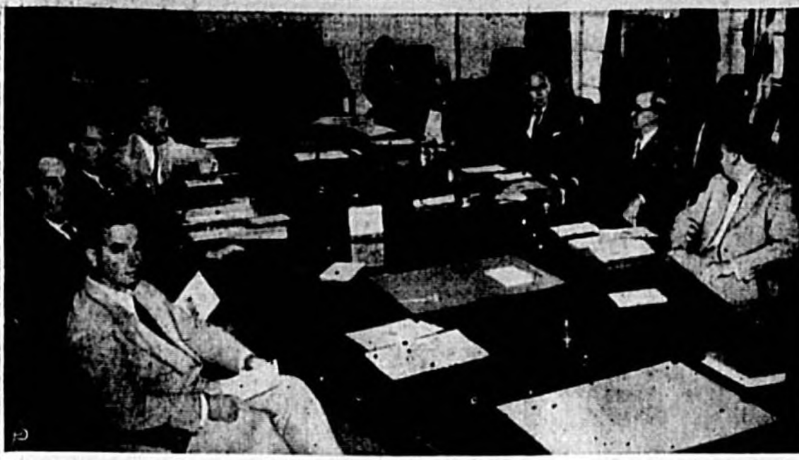
MEMBERS OF THE NATIONAL SECURITY COUNCIL are shown as they meet with President Truman at the White House. Clockwise, they are: Charles V. Whitney, Acting Air Force Secretary; Secretary of the Army Kenneth Royall; Sidney W. Souers, Council Secretary; Arthur M. Hill, chairman of the National Security Resources Board; Roscoe H. Hillenkoetter, Director of Central Intelligence; Maj. Gen. A. M. Gruenther, Joint Staff Director; unidentified; Defense Secretary James V. Forrestal; Secretary of State George C. Marshall; President Truman, Council Chairman, and John W. Kenney, Acting Secretary of the Navy.