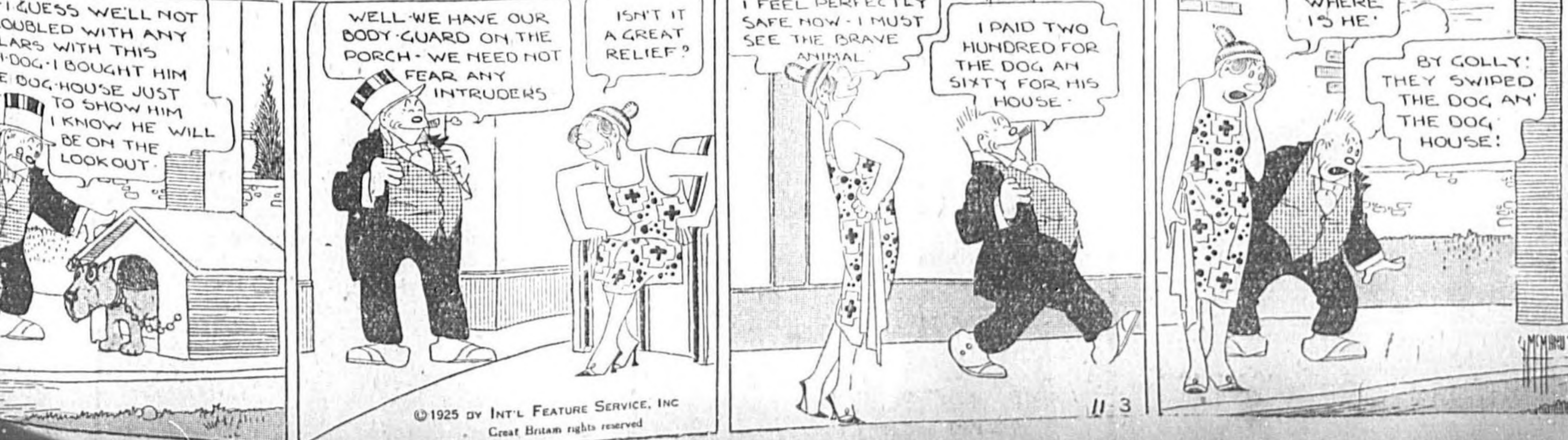
© 1925 by INT'L FEATURE SERVICE, INC. Great Britain rights reserved.

WAKE UP FATHER : : : : By GEORGE McMANUS