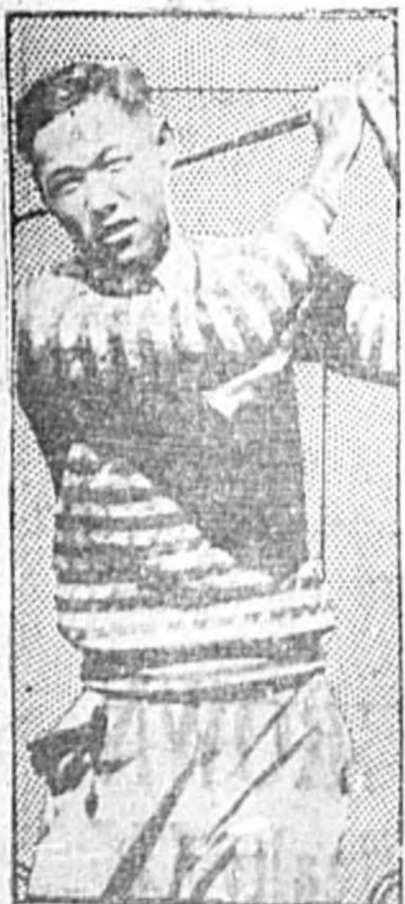
Charlie Chung, China's foremost golfer and present holder of the championship of the Hawaiian Islands, who is to compete in the $10,000 open tournament at Los Angeles next January. Te expects to make a good showing in his initial appearance in a big classic in