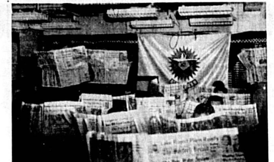
EVERYONE READS The Sanford Herald! While deployed, all the Check-entails of RVAH-11, land-based at Sanford Naval Air Station, read The Sanford Herald to follow the events at home. The longer they have been deployed the more the family men devour the papers to keep up with the news and make home feel a little closer. In Ready Room No. 3 aboard the aircraft carrier USS Forrestal (above) it's usually SHRO.