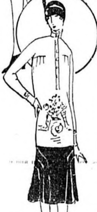
The smart black costume here consists of black cloth coat and skirt worn with embroidered metallic blouse. The hat is black with metallic ornament.