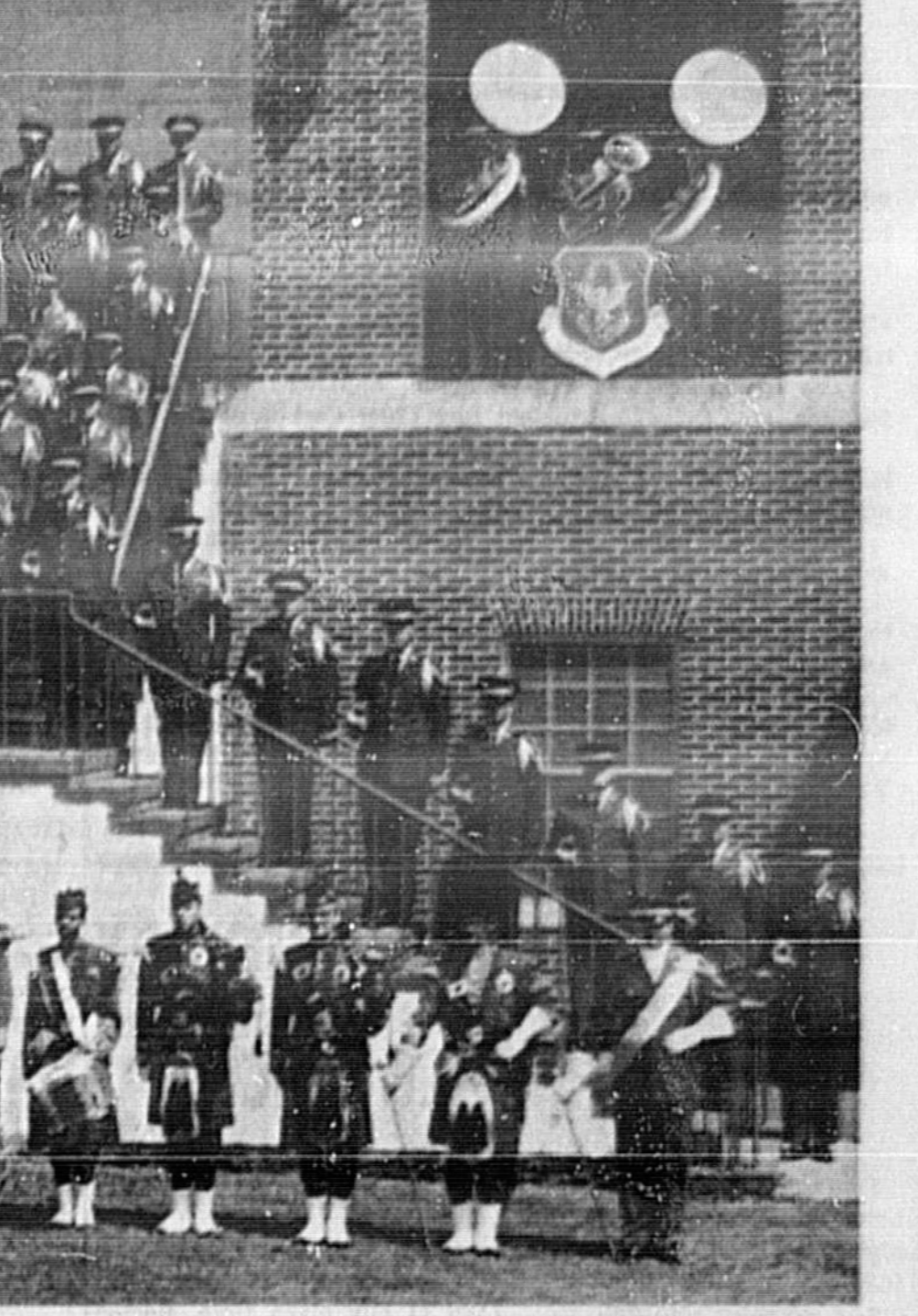
THE 45 MAN BAND of the Air Force Reserve, featuring a killed "Bagpipe Corps" will be the bonus concert to be presented by the Seminole Mutual Concert Association at 8 p.m. May 12 at the Civic Center.