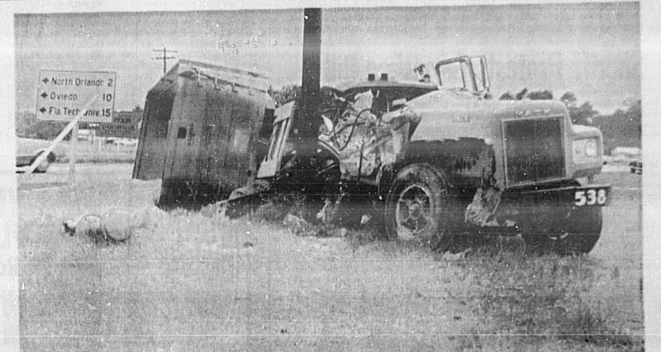
ONE LOAD OF GRAVEL . . . DELIVERED! TOTAL LOSS resulted when a tractor-trailer (above) went out of control Tuesday afternoon at intersection of SR 419 and U.S. 17-92 and crossed the median into a ditch before striking a utility pole.

By MARION BETHA The county road program was discussed in detail at yesterday's meeting of Seminole County Commissioners. It was stated that Brinson Avenue, Lake Mary Boulevard extension, Onara Road extension, Magnolia Avenue and Douglas Avenue in Altamonte Springs are still under construction.