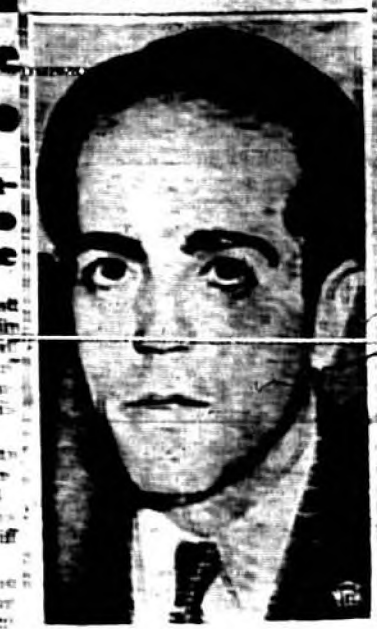
Portrait of a man in a suit, likely a political figure mentioned in the article.