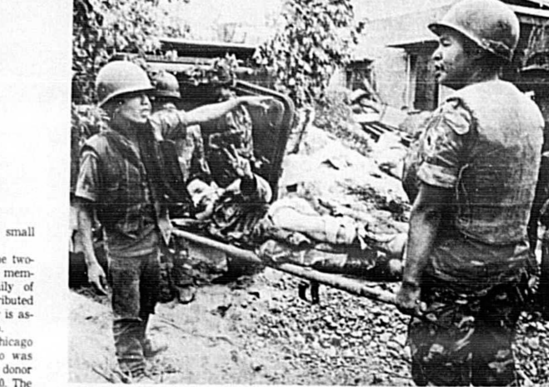
PEACE IS THE SIGNAL from a South Vietnamese soldier wounded in the Quang Tri fighting, and apparently he'll have some for some time.

WASHINGTON (AP) — Campaign contributors tossed another $2.45 million into President Nixon's re-election fund during June and July, newly filed public records show.