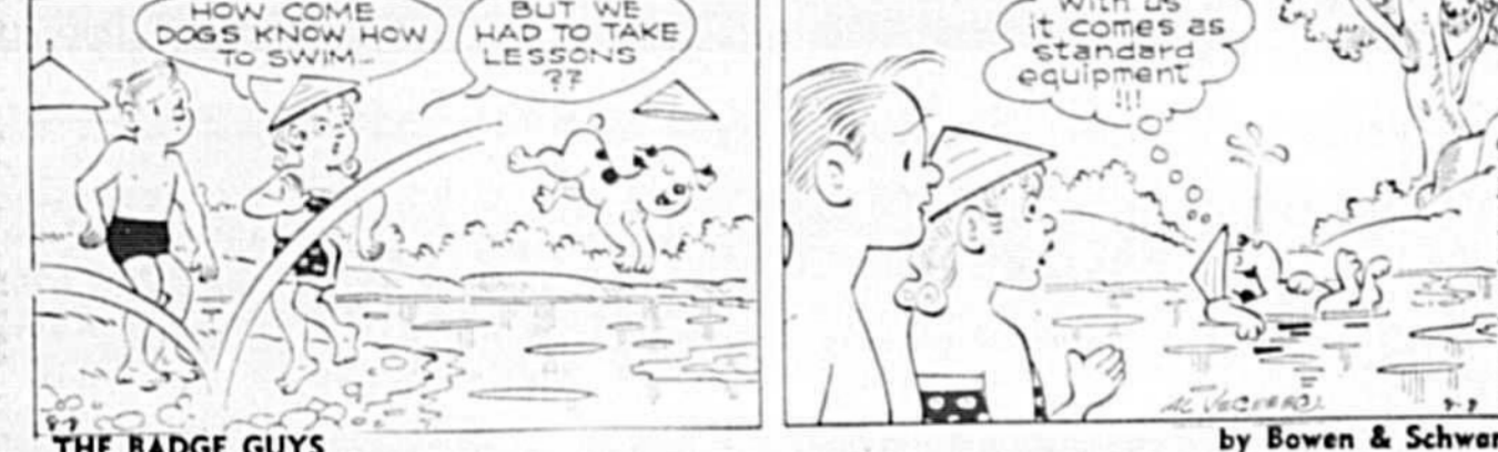
THE BADGE GUYS