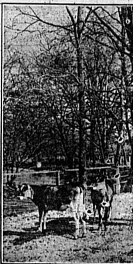
YOUNG BEEF STOCK

The owner of a small farm who has equipped his place with a silo and established a field of alfalfa can profitably handle a carload of beef cattle every year.