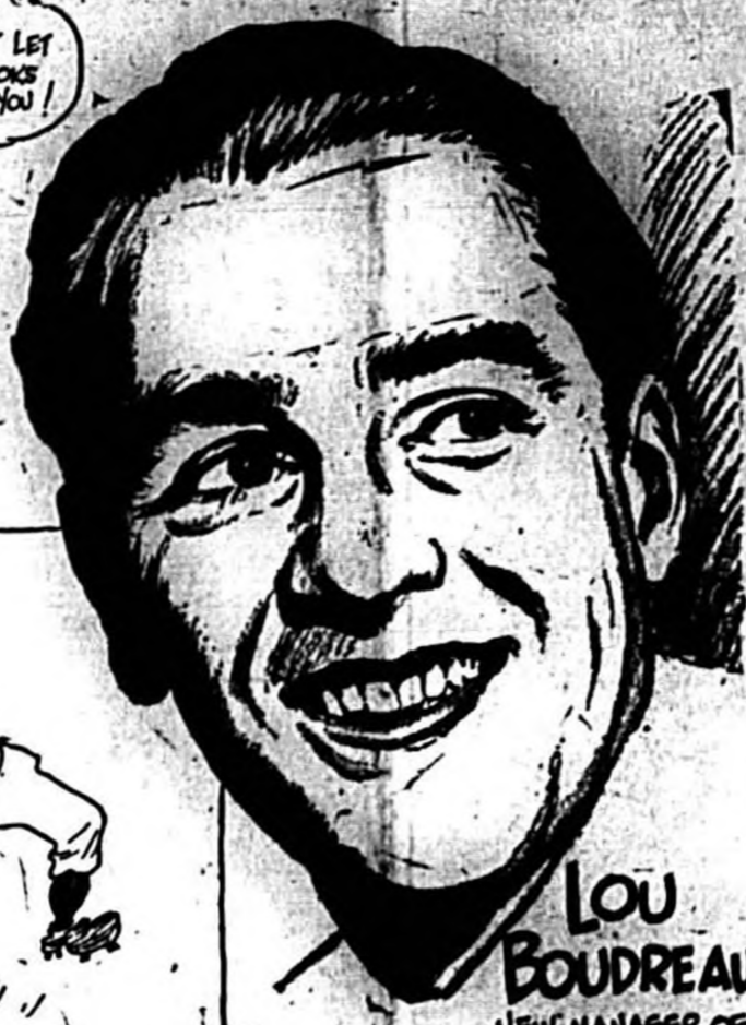
LOU BOUDREAU NEW MANAGER OF THE CLEVELAND INDIANS