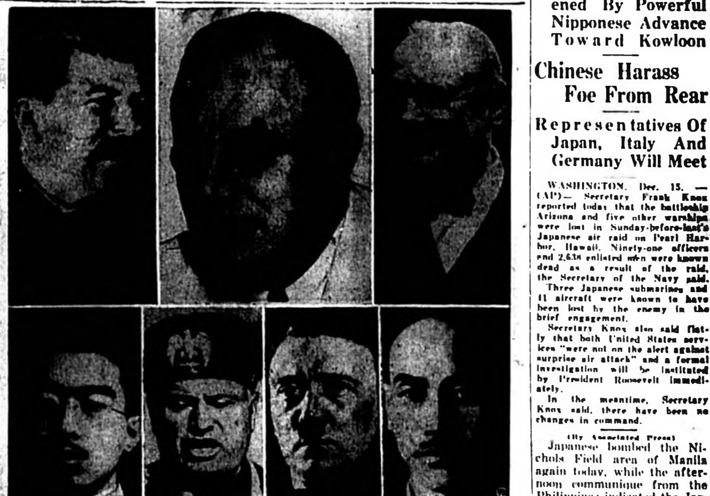
Here are the leaders of the world's great powers at war on land, sea and air. Top, left to right: Josef Stalin, whose peace pact with Germany fell apart when the Nazis invaded the sprawling Sovietia; President Roosevelt, opinion became molded into a unified resolve leader of a United States whose diversified when it was attacked; Prime Minister Winston Churchill, leader of the world's largest democracy; Bottom, left to right; Emperor Hirohito, whose island kingdom was led into war by a Japanese military clique under the direction of Army Premier General Tojo; Benito Mussolini, who built Italy into a war machine which he has turned over to Germany; Adolf Hitler, whose dreams of a super race drove him to defy the world's great democracies and start the war; Gen. Chiang Kai-shek, leader of China's valiant millions, now fighting since 1937 against the Japanese.